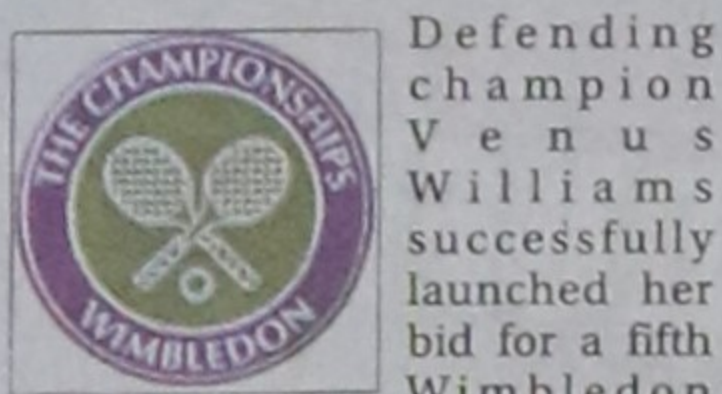
Defending champion Venus Williams successfully launched her bid for a fifth Wimbledon title on Tuesday as a sun-kissed All England Club waited to greet fellow superstars Rafael Nadal and Maria Sharapova.