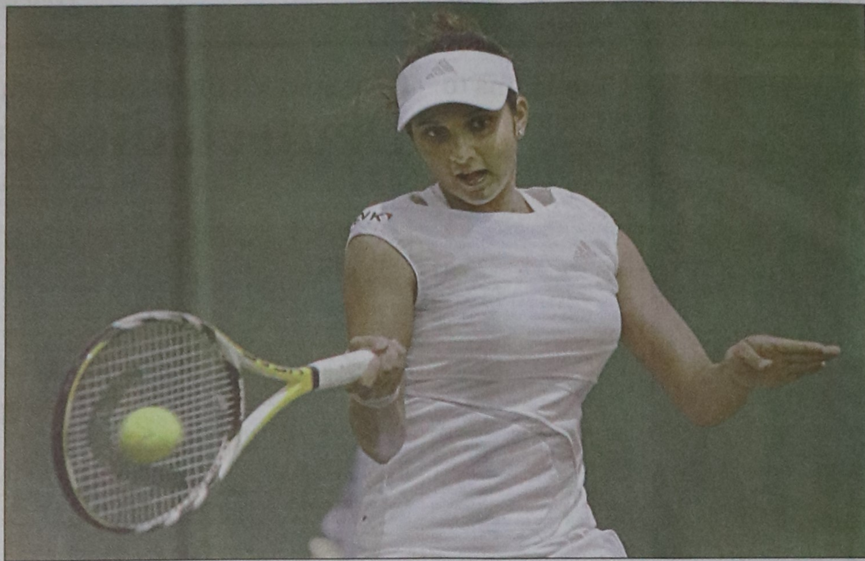
Indian tennis sensation Sania Mirza plays a forehand return against Colombian Catalina Castano in the first round of the Wimbledon Championships at the All England Club in London yesterday. Mirza won 7-6 (7/3), 3-6, 6-4.