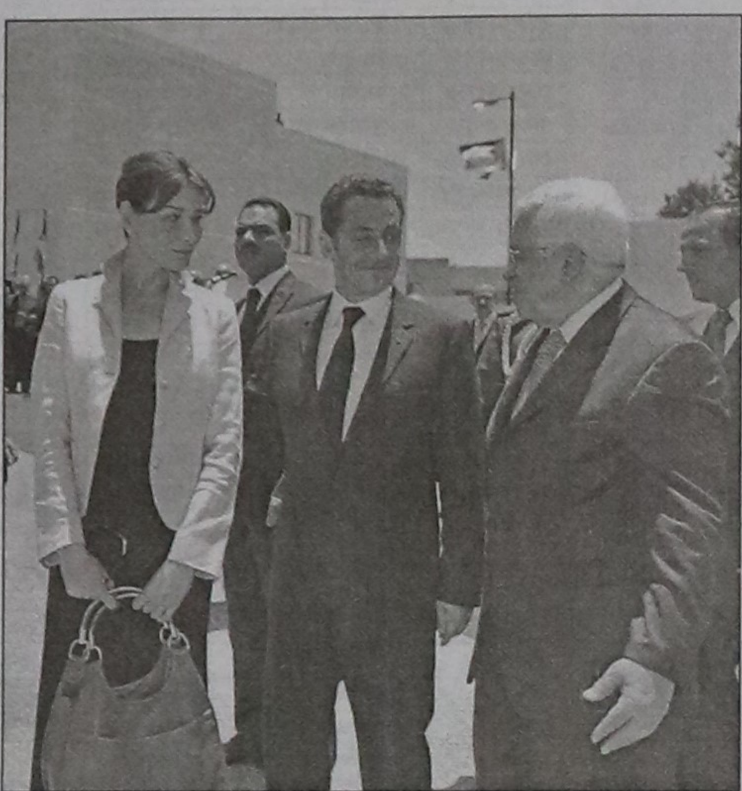
French President Nicolas Sarkozy (C) and his wife Carla Bruni-Sarkozy (L) are welcomed by Palestinian President Mahmoud Abbas (R) yesterday in Bethlehem.