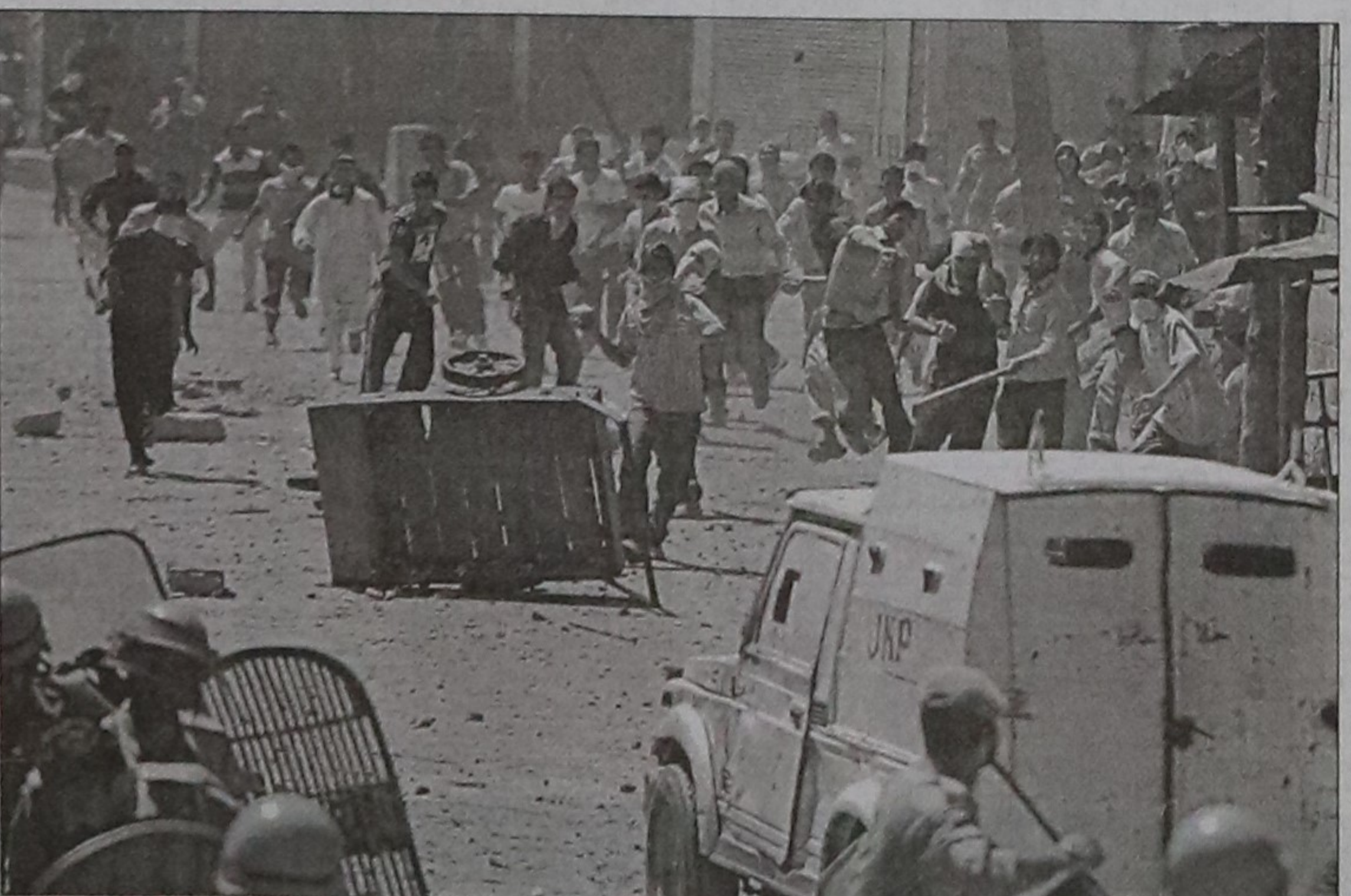
Kashmiri protestors throw pieces of bricks towards Indian police in Srinagar yesterday. Indian police fired teargas shells as hundreds of stone pelting protesters staged fresh street demonstrations in parts of Kashmir's main city against a government decision to transfer forest land to a Hindu shrine trust.