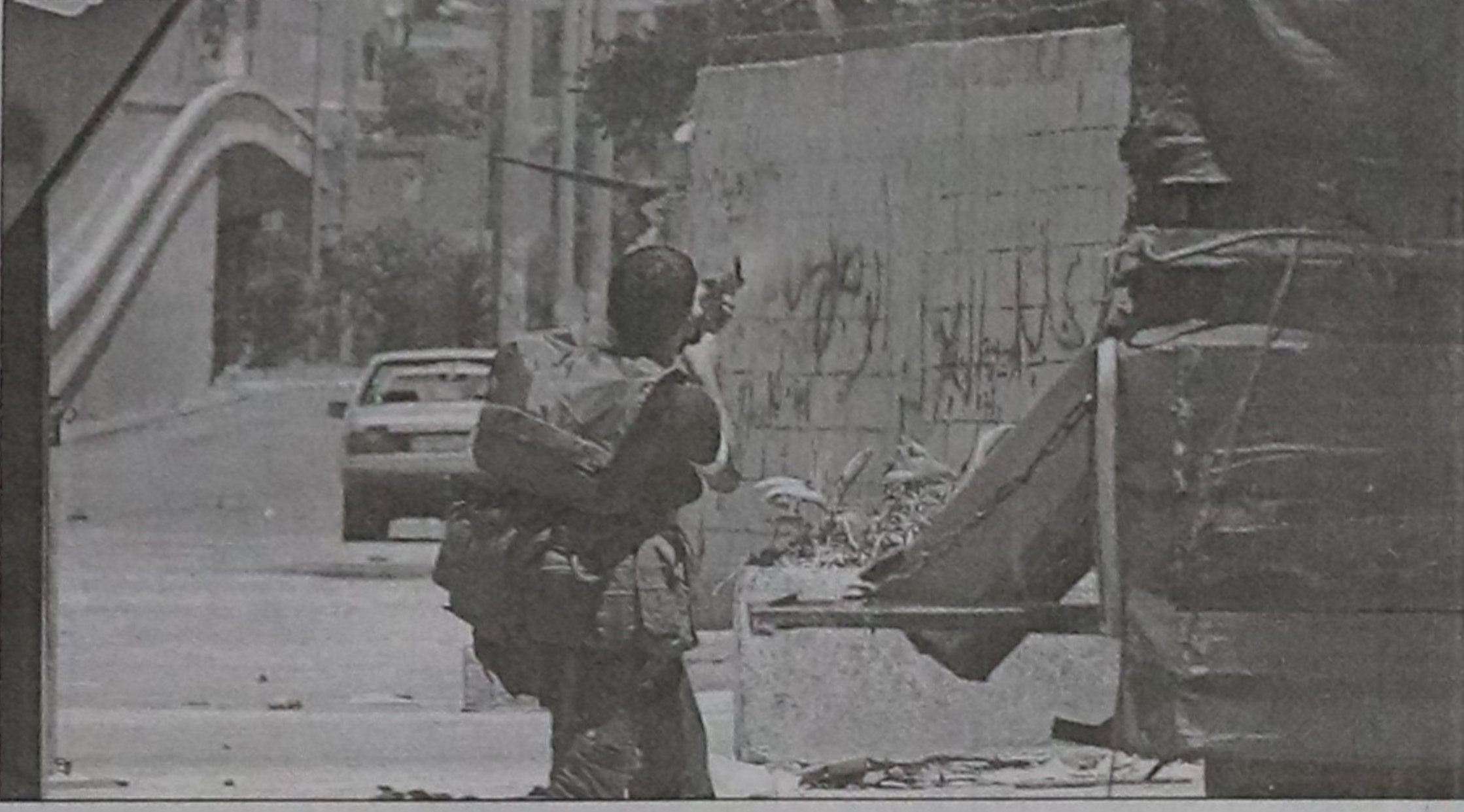
A Sunni fighter responds to a source of fire during clashes in Bab al-Tebbaneh neighbourhood in the northern Lebanese city of Tripoli yesterday. Two persons were killed yesterday in fierce sectarian clashes that erupted at the weekend in Tripoli.