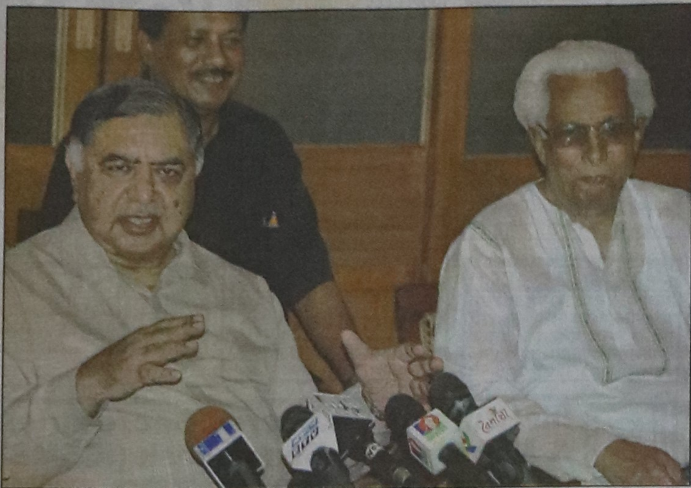
Gono Forum President Dr. Kamal Hossain speaks at a press briefing at his residence at Bailey Road in the city yesterday. On his left is presidium member Pankaj Bhattacharya. (Story on Page 1)