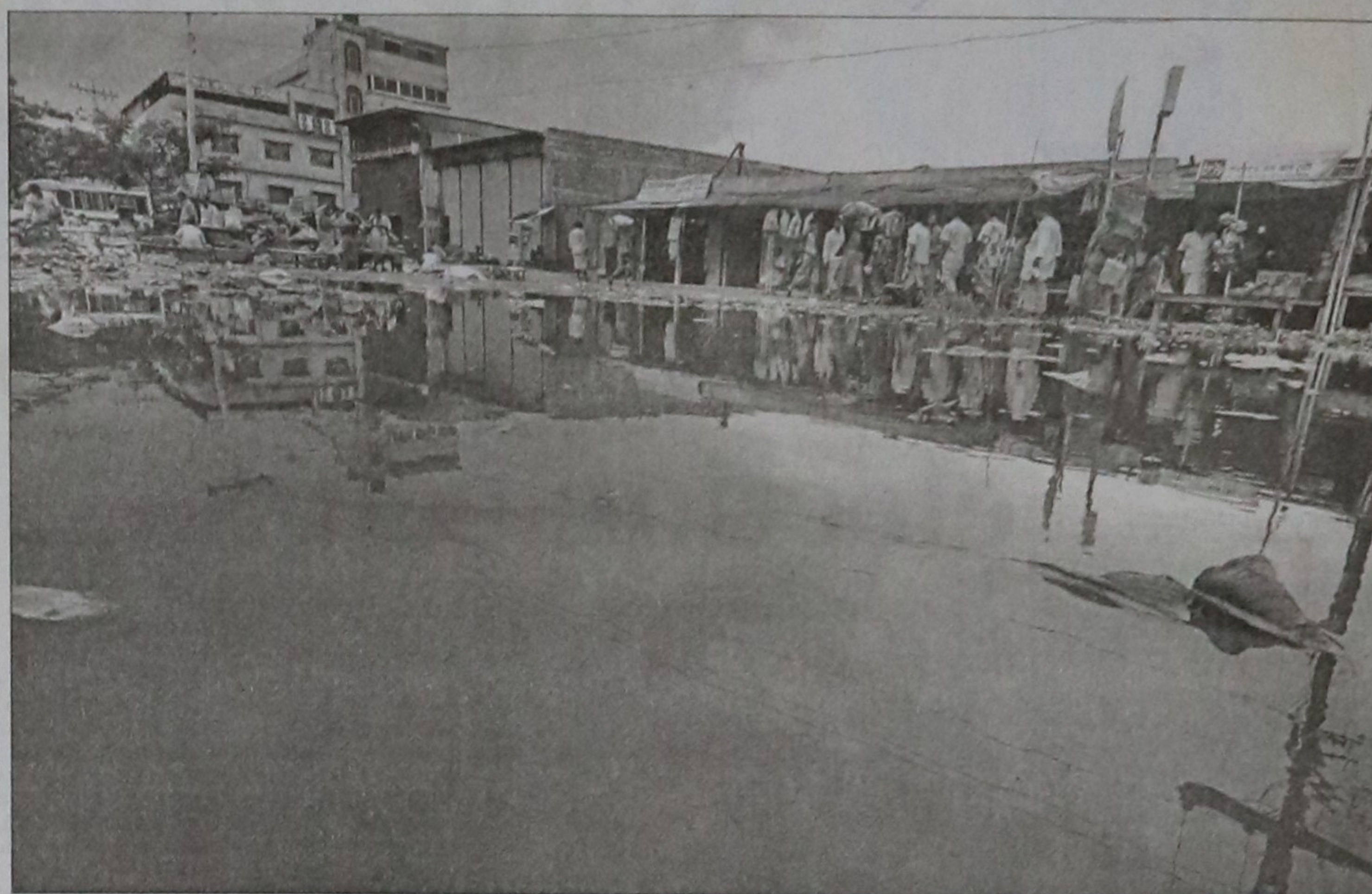
Rainwater remains stagnant beside the Aganagar main road at Keraniganj upazila causing untold suffering to the local people. The photo was taken yesterday.

Relatives and admirers are requested to pray for peace of the departed soul.