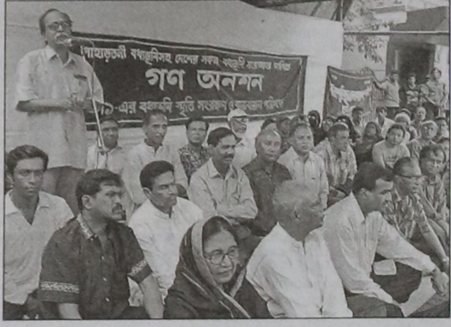
Eminent historian Prof Dr Muntasir Mamun speaks at a mass hunger strike on the Chittagong Press Club premises in the port city yesterday. Ekattorer Badhyabumi Smriti Sangrakkhon O Bastobayan Parishad organised the programme.

Activists of Bigyan Pathagar (science library) also formed a human chain at the venue while members of Samageet, a cultural organisation, rendered songs.