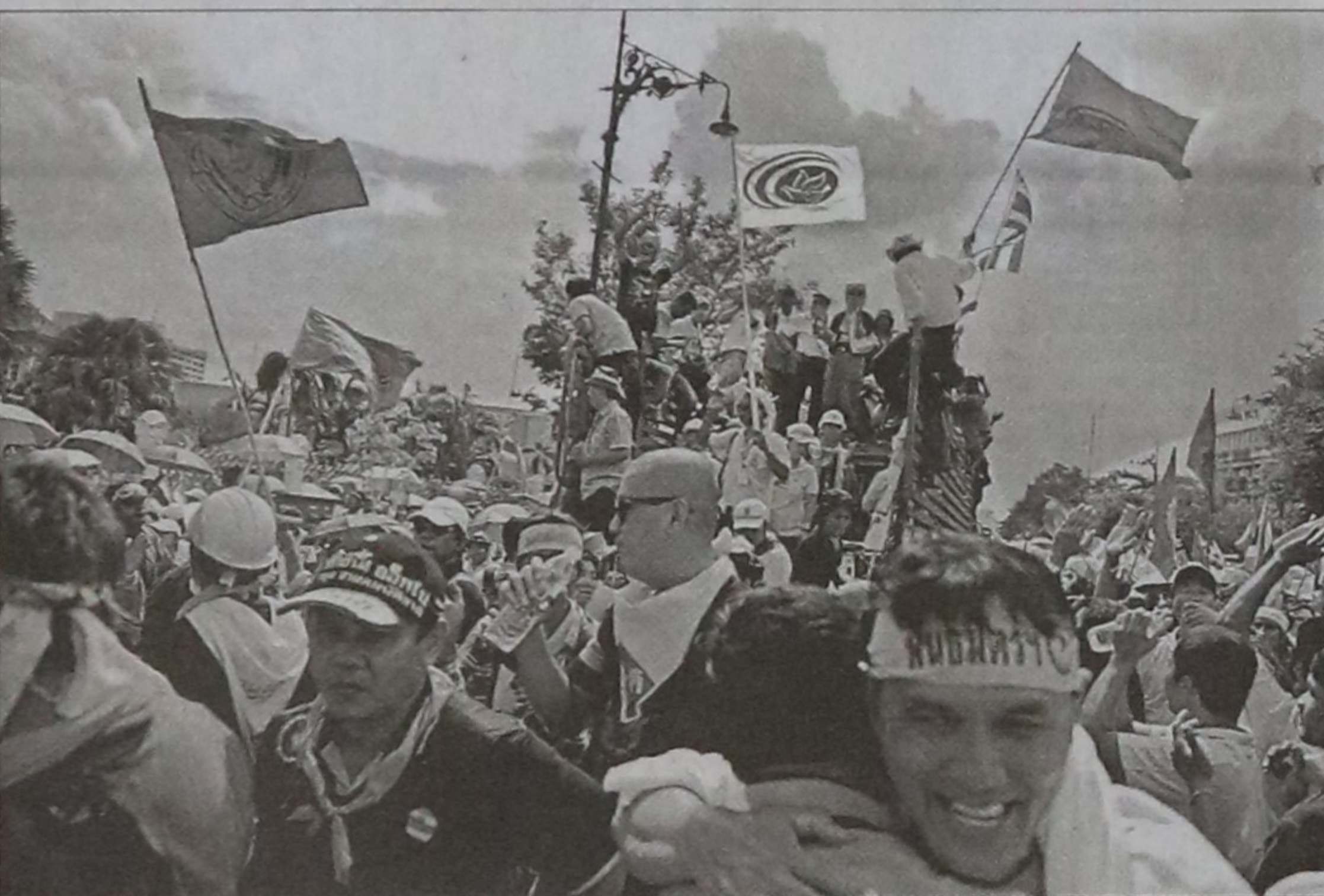
Members of People's Alliance for Democracy (PAD) wave national flags after breaking through police lines in front of the Government House in Bangkok yesterday. At least 8,000 Thai protesters on Friday pushed past a police barricade to the gates of Prime Minister Samak Sundaravej's office, demanding his resignation.

Tamil Tigers have fought since 1983 to create an independent homeland for minority Tamils who have been marginalized by successive governments controlled by majority Sinhalese. More than 70,000 people have been killed.