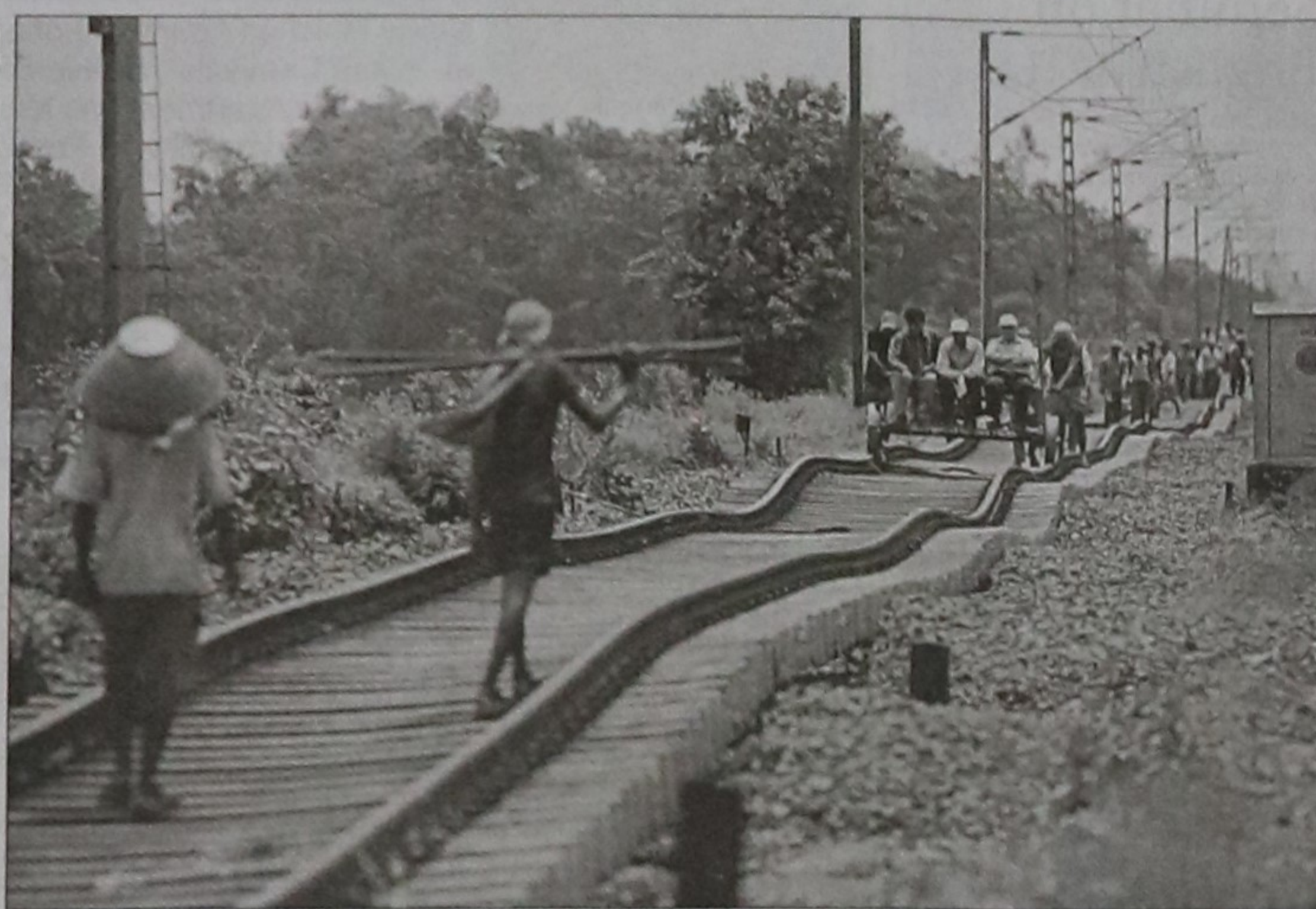
Indian railway workers survey damaged railway tracks, which connect Orissa with West Bengal, after they were damaged by floodwaters in Midnapore, some 150km south of Kolkata yesterday. Chief Minister of the Indian state of West Bengal Buddhadev Bhattacharjee described the flood situation in the twin districts of Midnapore as 'very bad' with at least 25 people dead and some two millions displaced.

He has repeatedly portrayed his opponent in the run-off poll, Morgan Tsvangirai, as a stooge of former colonial power Britain and