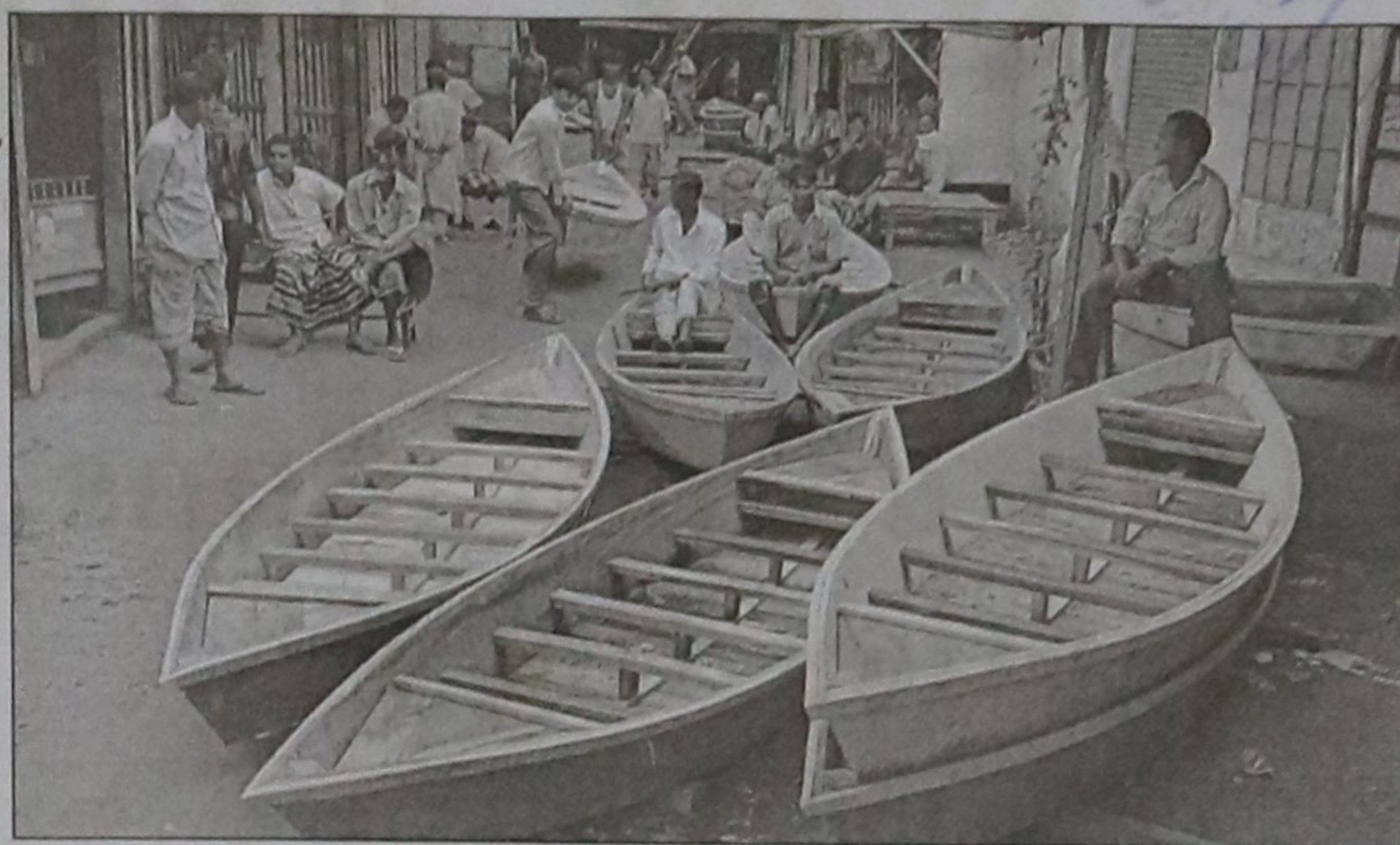
Boat sellers wait for customers at a market near Rajendrapur bus stand in Keraniganj yesterday. With the outset of monsoon, supply of new boats has increased. The price of a boat ranges from Tk 1800 to Tk 3000 depending on their size.

In overall competition, Khulna sector became champion while Sadar rifle battalion became runner-up.