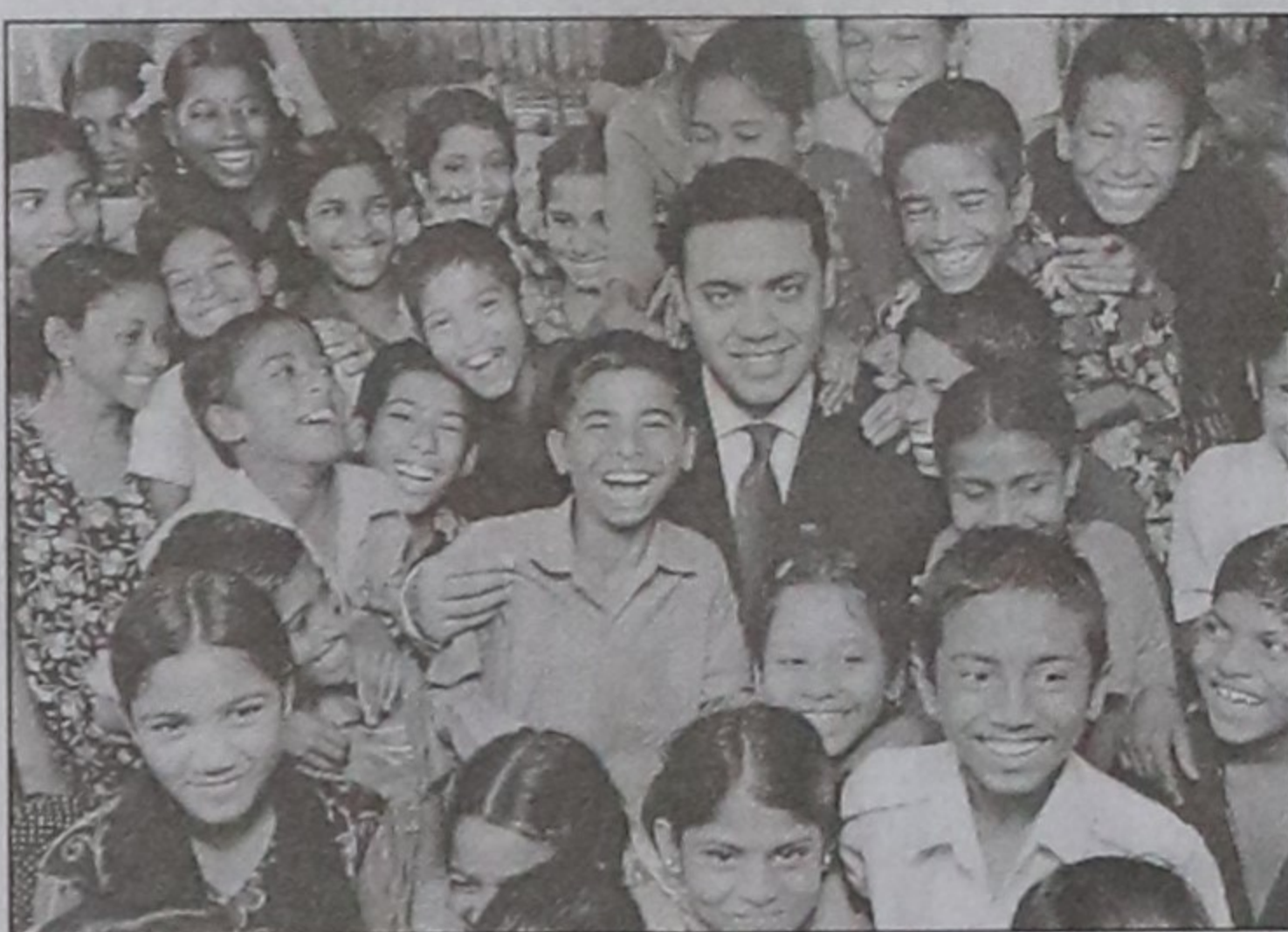
Students of Korail North Primary School pose with British Minister for International Development Shahid Malik during his visit to the Brac school in the city on Thursday.

The speakers called upon the authorities to take strong measures to ensure good housing facilities for the poor people in the urban areas.