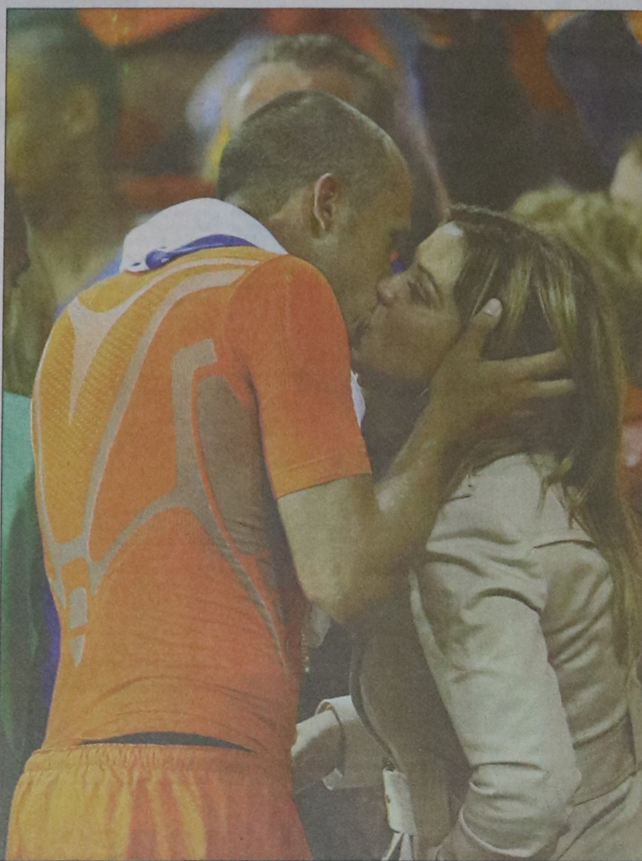
A JOB WELL DONE: Dutch defender John Heitinga kisses his girlfriend after his side's 2-0 win against Romania in the Euro 2008 at Stade de Suisse Wankdorf in Bern on Tuesday.