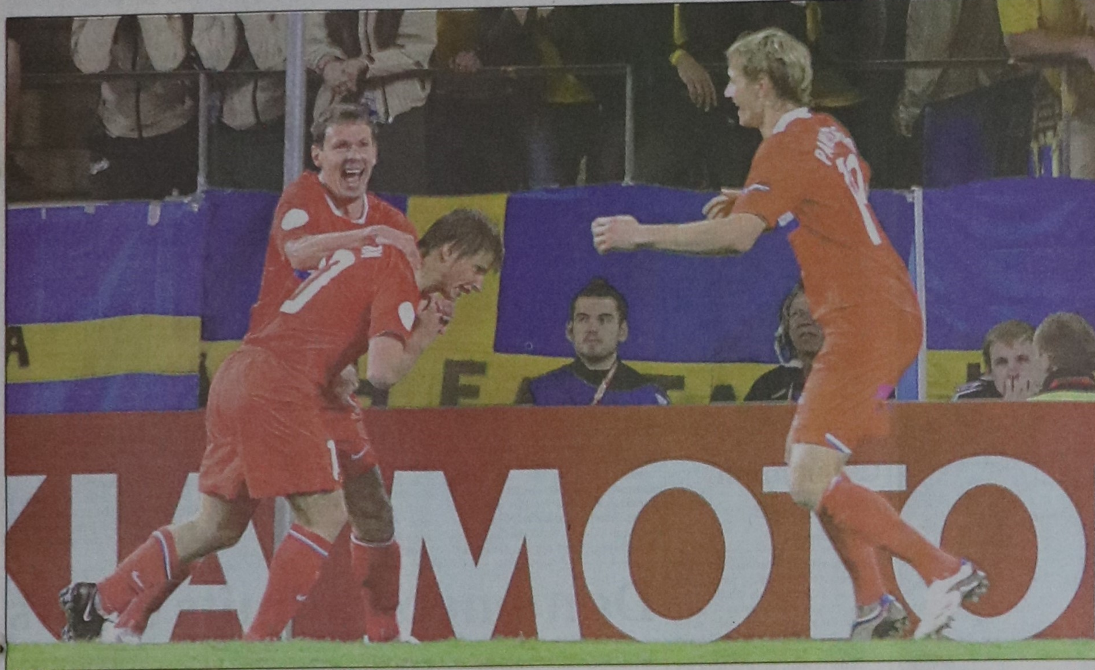
Russian forward Andrei Arshavin (2nd from R) celebrates with teammates after scoring the second goal against Sweden during their Euro 2008 Group D match at the Tivoli Neu Stadium in Innsbruck on Wednesday.