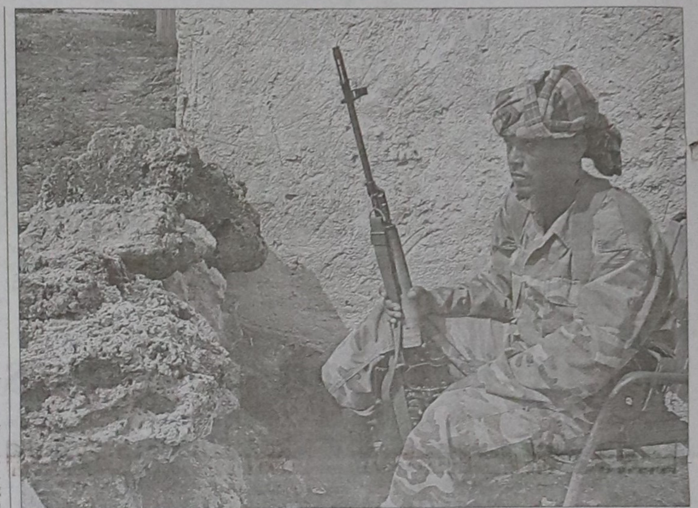
An Ethiopian soldier mans a position yesterday in Somalia's embattled capital following a fresh outbreak of violence. Three days of fighting between Somali forces and Islamist militants in Mogadishu have claimed 10 lives.

The officer travelled to Zimbabwe on Sunday but was expelled on Tuesday, said Arbour, who denounced the move by Harare as "uncooperative" and "untimely".