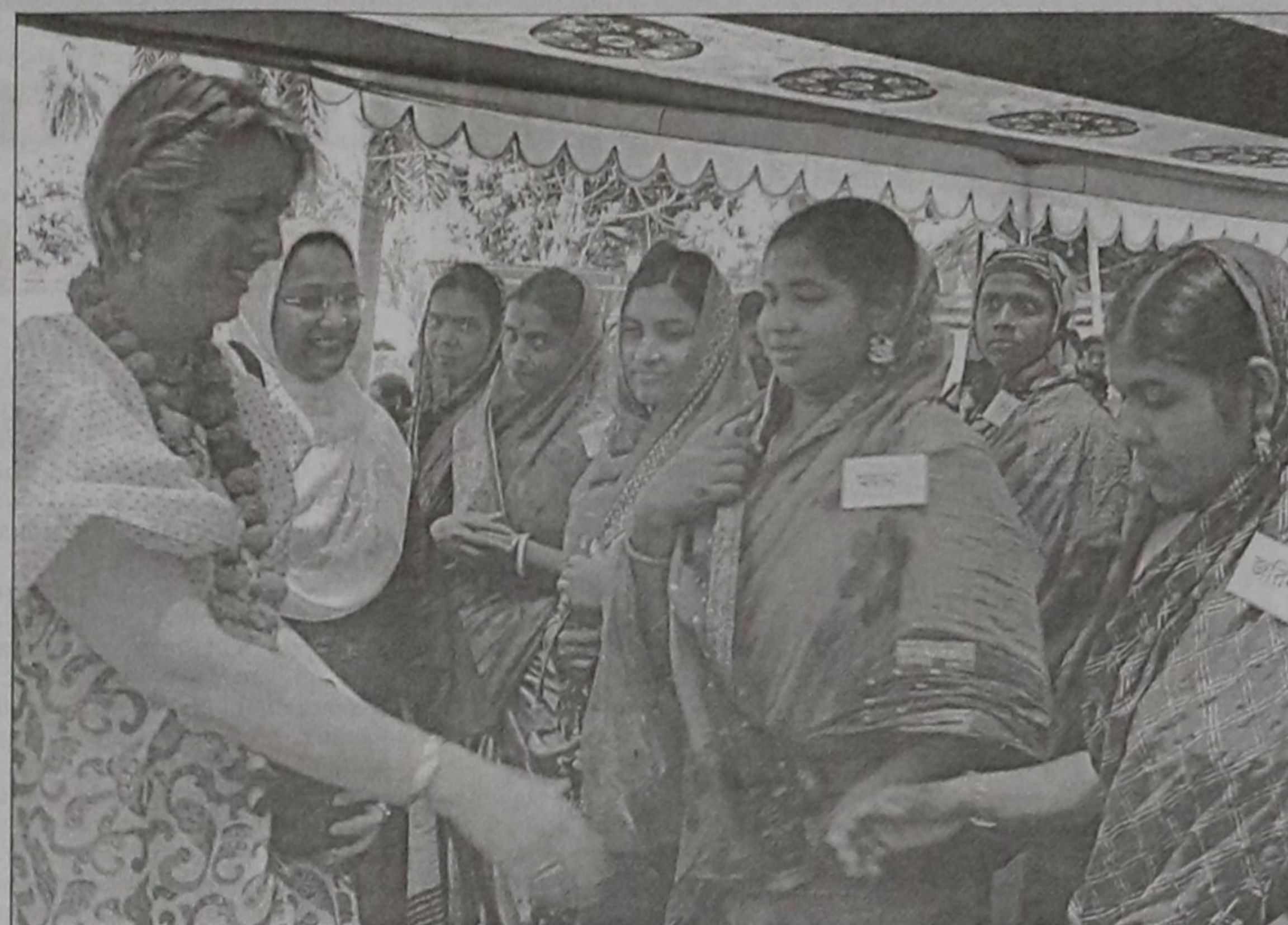
Australian Deputy High Commissioner Kilmeny Beckering Vinckers recently met participants from the first phase of a project on dressmaking and hand embroidery training for destitute women.

The deputy high commissioner also exchanged greetings with the participants and admired their handiworks while visiting the training centre.