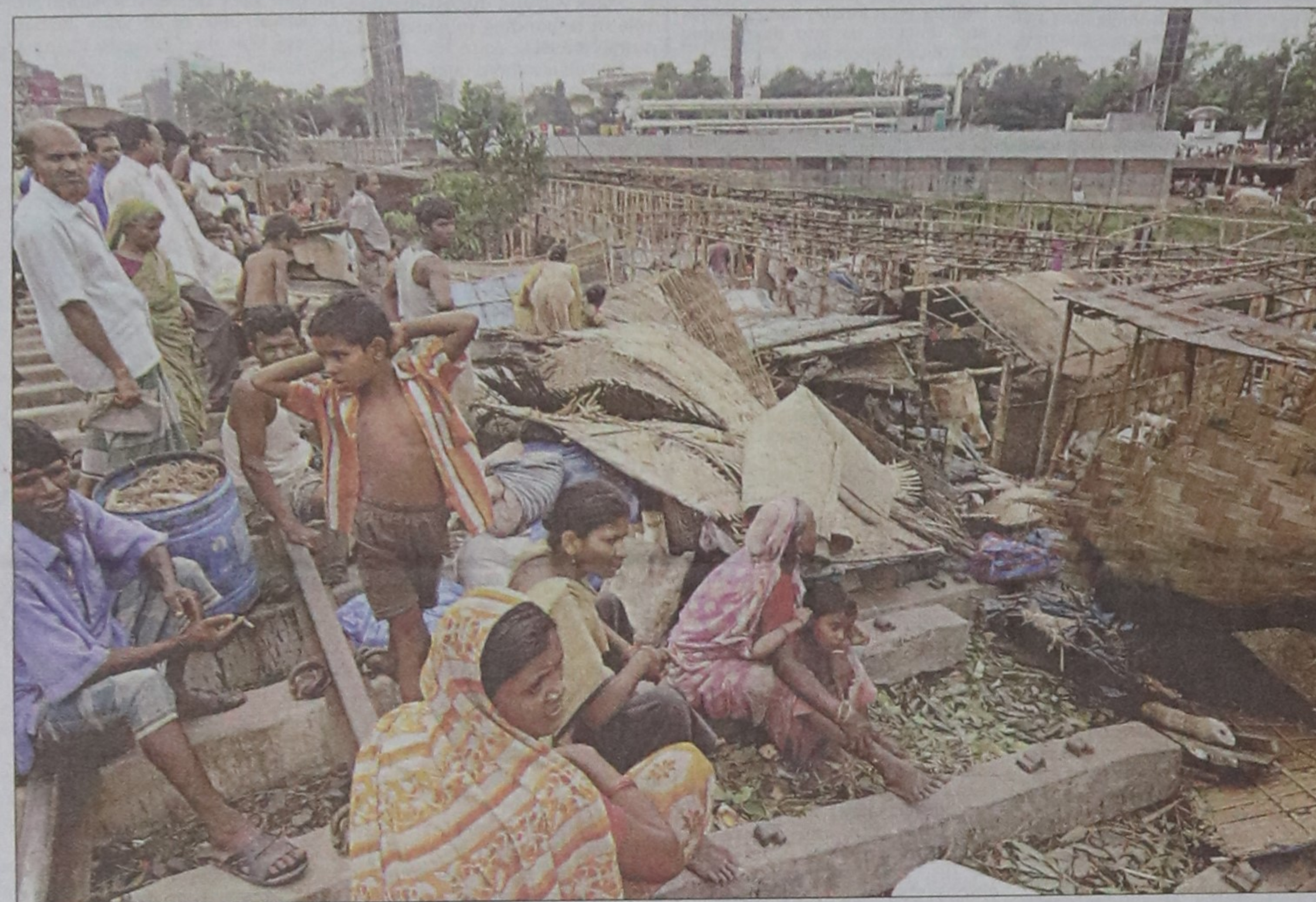
Slum-dwellers in the city's Hatirjheel-Begunbari area take refuge on railway lines as Rajdhani Unnayan Kartripakkha yesterday knocks down shanties encroaching on Begunbari canal.