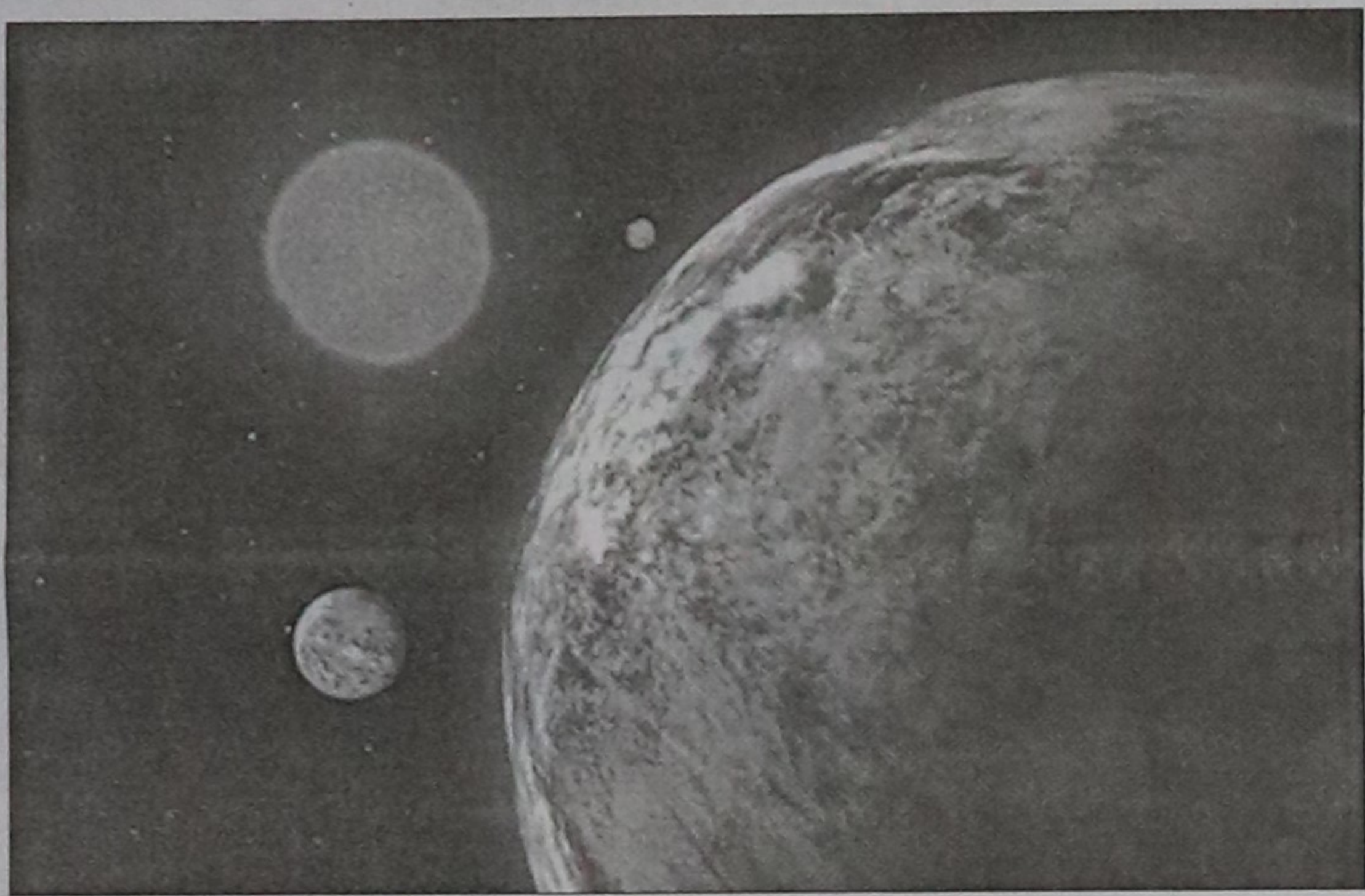
This artist's impression by the European Organisation for Astronomical Research in the Southern Hemisphere (ESO) website shows a trio of super-Earths discovered by a European team. European scientists on Monday said they had located five 'super-Earths', each of them between four and 30 times bigger than our planet, in a trio of distant solar systems.

Iraq is due to hold local elections on October 1 in its 18 provinces, a key benchmark set by Washington to stabilise the violence-wracked country by giving more power to local councils, especially for economic projects.