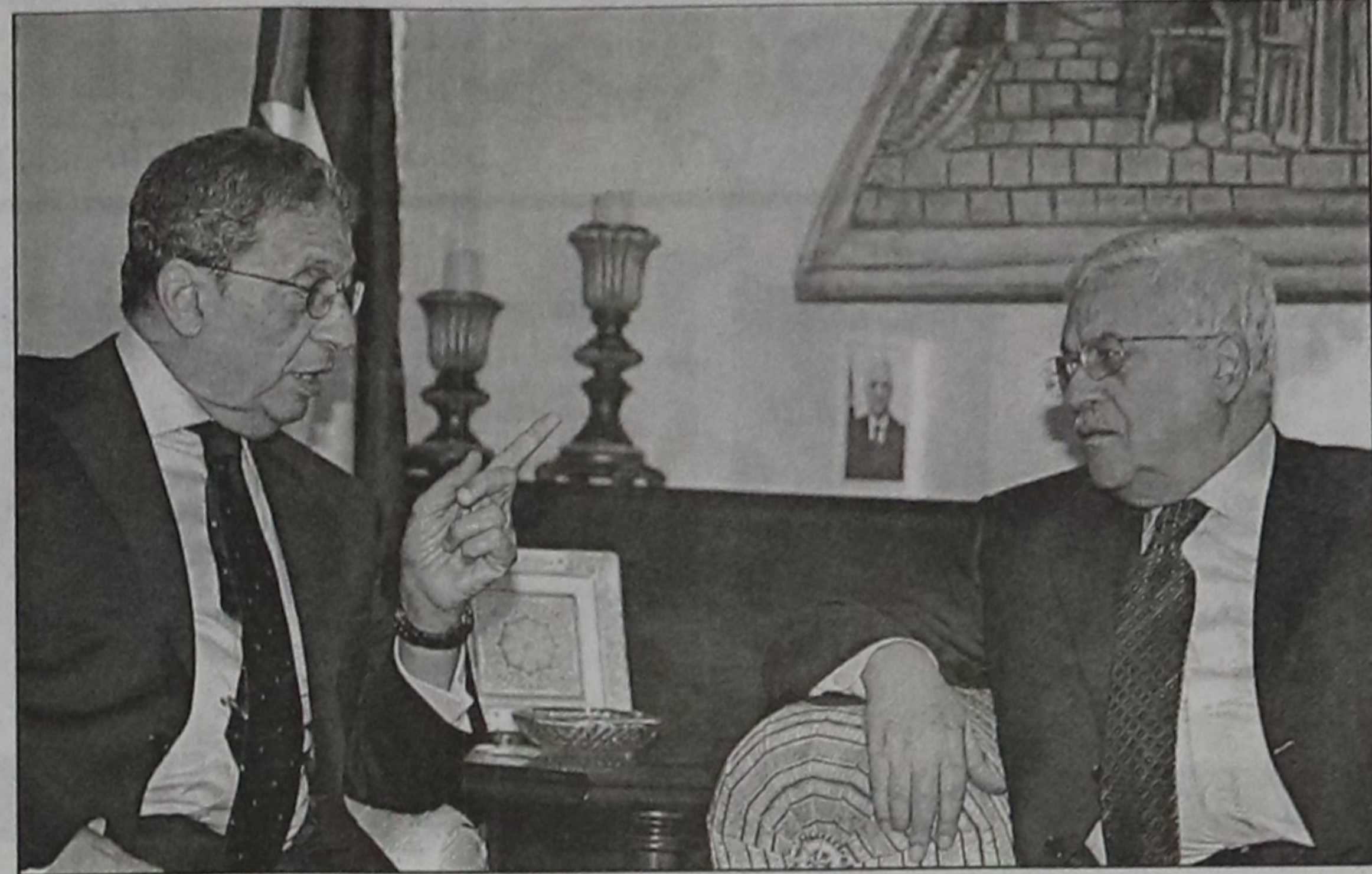
Arab League Secretary General Amr Mussa gestures toward Palestinian President Mahmud Abbas during a meeting in Amman on Monday. Mussa blasted Israel's settlement policy in the West Bank and east Jerusalem, warning that it threatens Palestinian-Israeli talks and the Middle East peace process.

Israel has said such a truce must include a halt to the smuggling of weapons from Egypt.