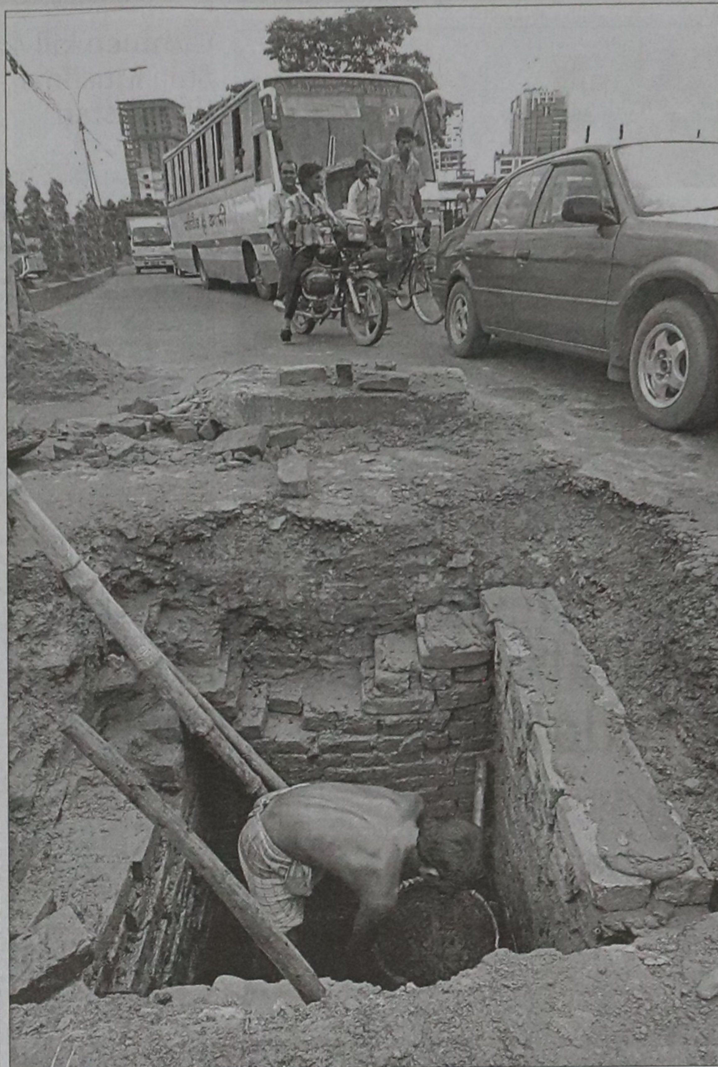
Vehicles get stuck in a traffic jam yesterday as Dhaka City Corporation workers repair a big pothole developed in the middle of the Badda-Gulshan Link Road in the city due to torrential rain on Monday night.

Set up in 1985, Saarc has been criticised for achieving little -- mostly because of tensions between key members India and Pakistan, who have fought three wars, two over the disputed region of Kashmir.