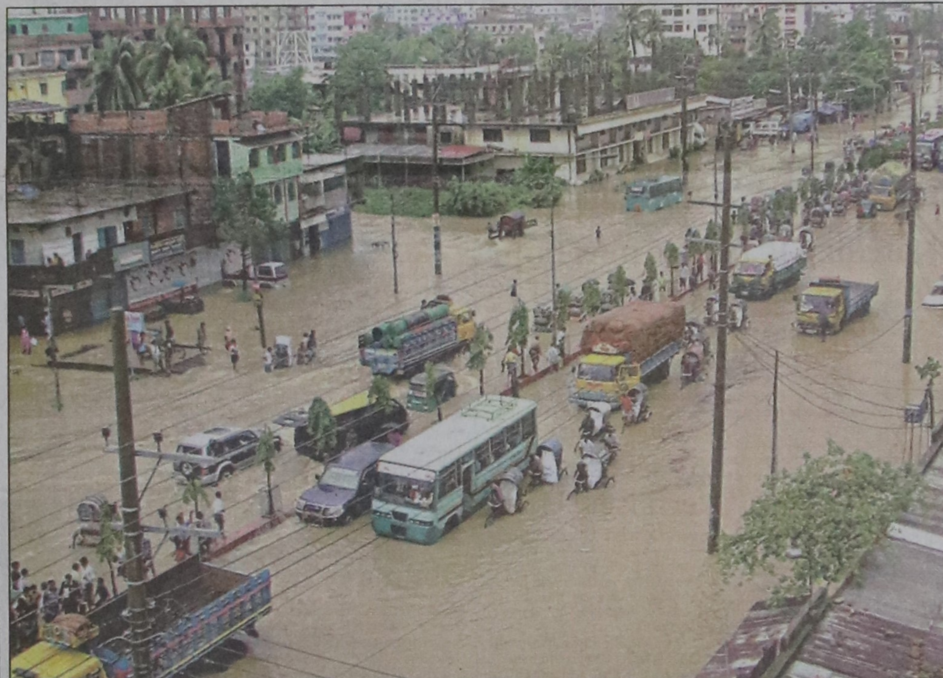
Vehicles slog through knee-deep water on the main thoroughfare at Bahadderhat in Chittagong after deluge throughout yesterday swamped much of the port city. (Story on page 16)