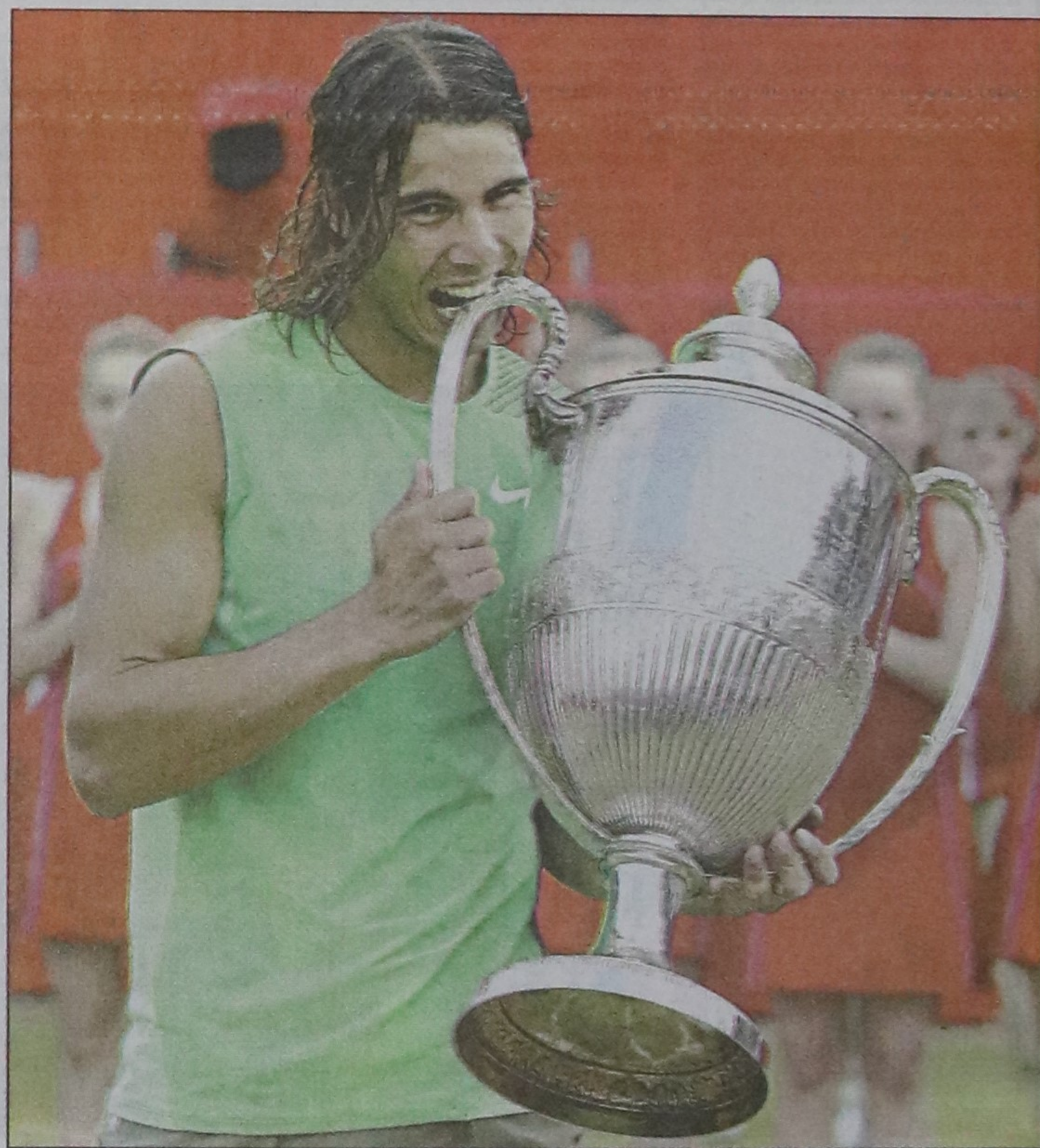
Spaniard Rafael Nadal bites the winner's trophy after beating Serbian Novak Djokovic in the final of the Queen's Club tournament in London on Sunday.

For short periods of an enthralling Queen's final, Djokovic had the better of Nadal as he rained down a hail of bruising shots from the baseline.