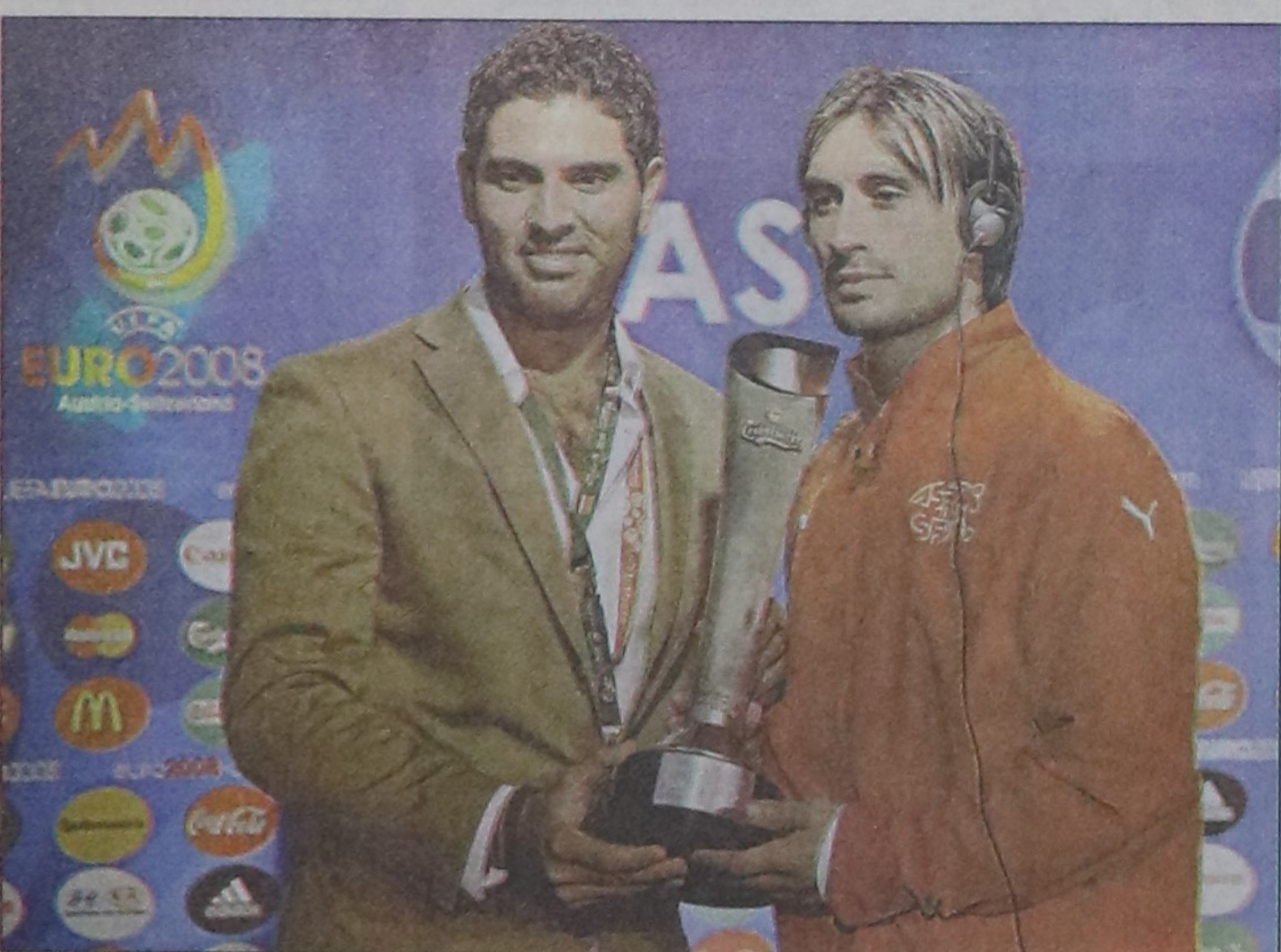
Indian cricketer Yuvraj Singh (L) hands over the Carlsberg man-of-the-match trophy to Swiss striker Hakan Yakin after their Euro 2008 match against Portugal in Basel on Sunday. Yakin scored both goals as Switzerland won 2-0.

Poland were denied a point three minutes from time as Runje denied Tomasz Zahorski, running out of his goal to block him with his legs.