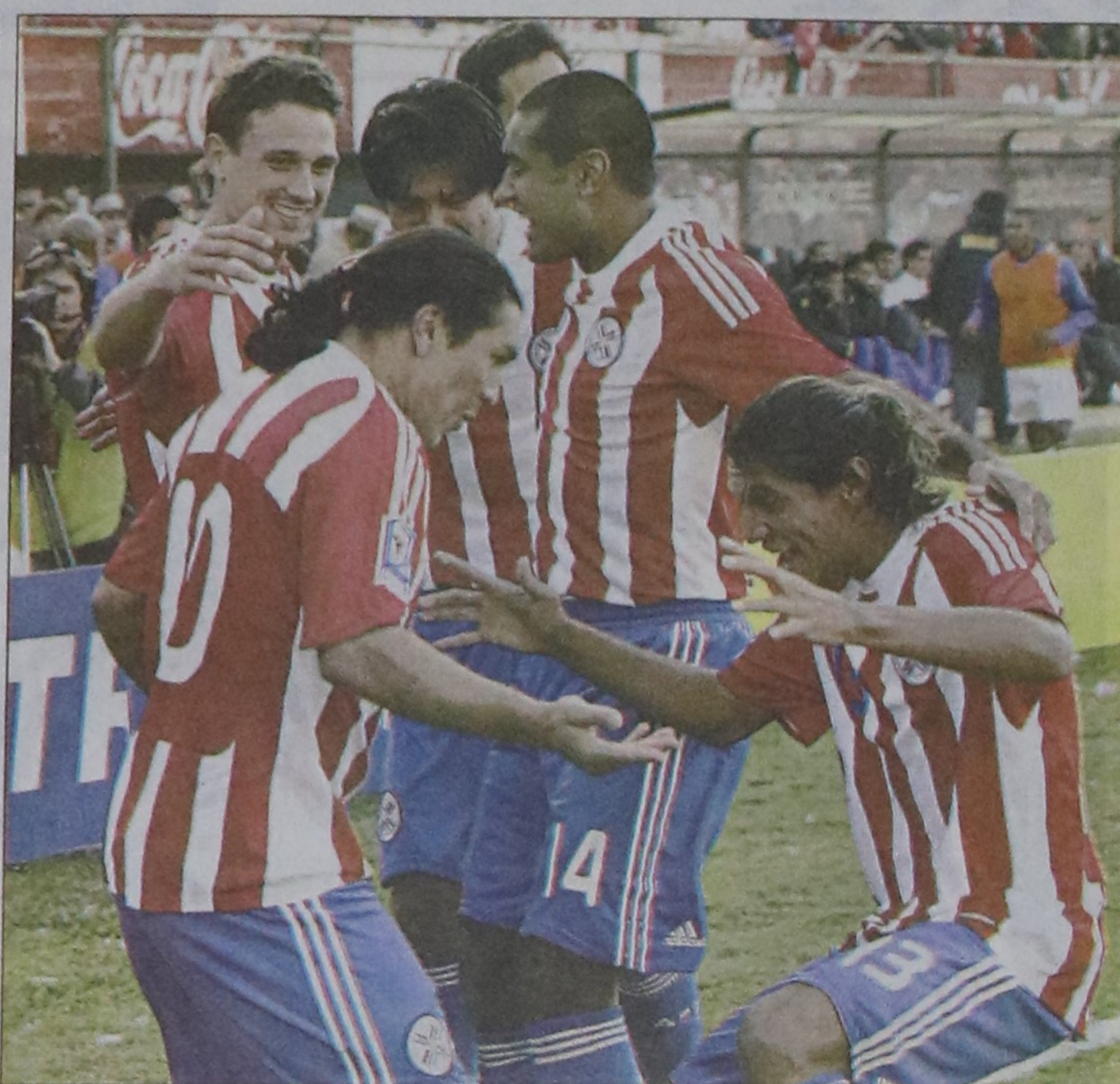
Paraguay players celebrate after Salvador Cabanas (L) scored the second goal against Brazil during their World Cup 2010 qualifying match at the Defensores del Chaco Stadium in Asuncion on Sunday.

The TV umpire will be entitled to use slow motion replays from all available cameras, sounds from the stumps microphones and the HawkEye system for tracking the trajectory of the ball.