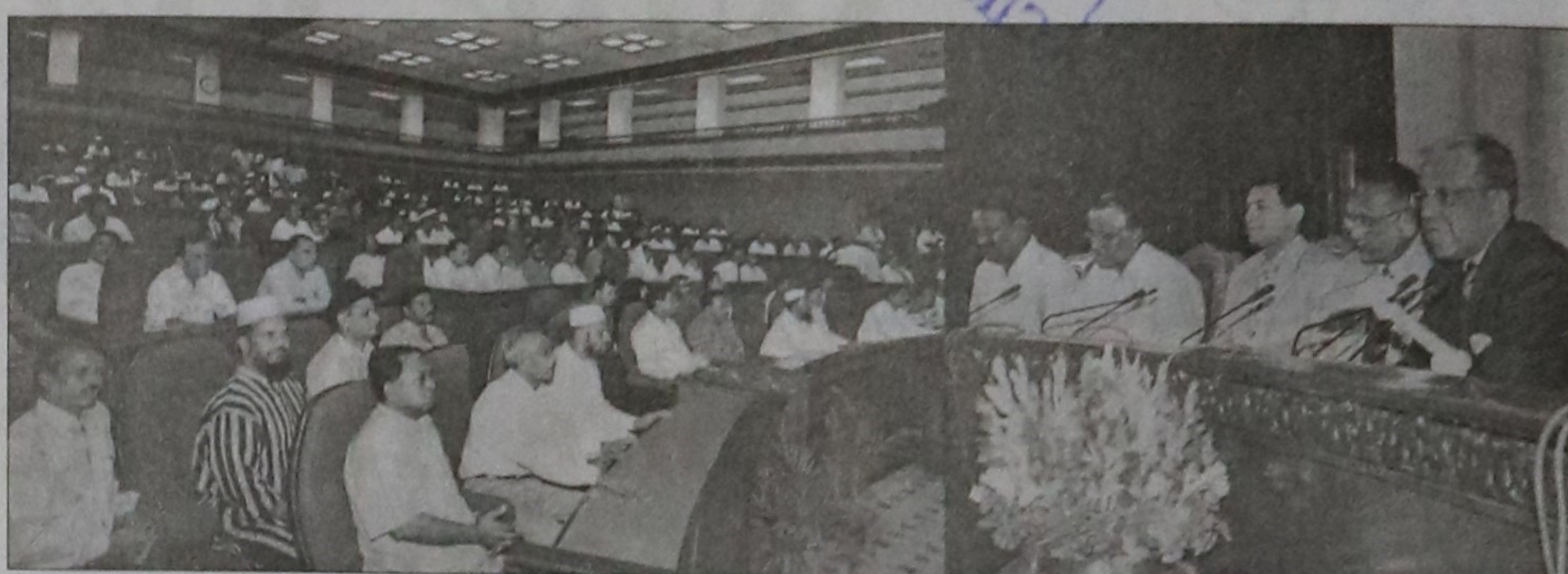
Chief Adviser Fakhruddin Ahmed holds talks with the representatives of pourasava, city corporation and union parishad as part of the on-going national dialogue.

Contributions can be sent to his bank account: SB 12834, Pubali Bank, Shahbagh Avenue Branch, Dhaka.