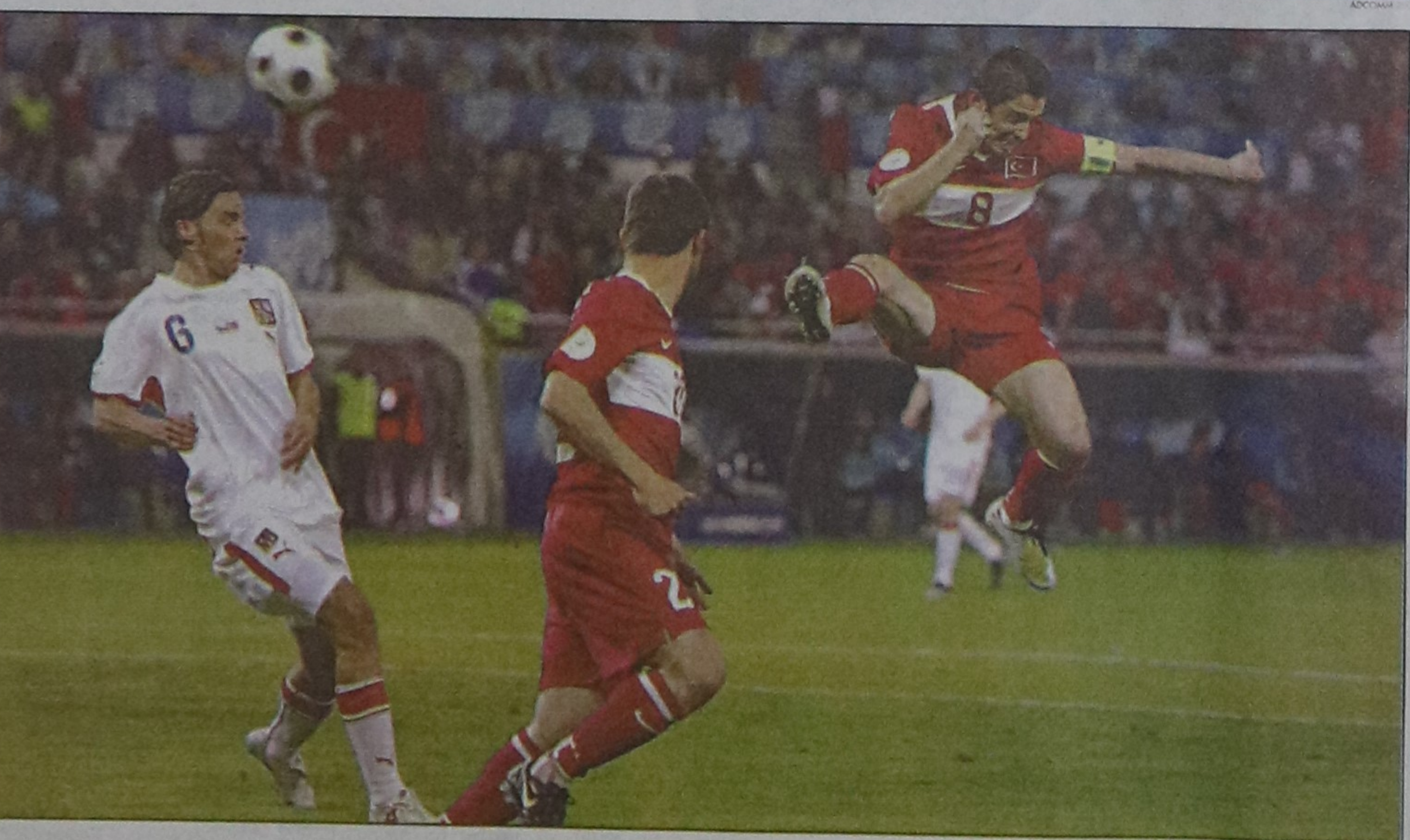
AND THE TURKS ARE THROUGH: Turkey superstar Nihat Kahveci (R) scores the winning goal against Czech Republic in the 89th minute of their Euro 2008 final Group A match at the Stade de Geneve in Geneva yesterday.