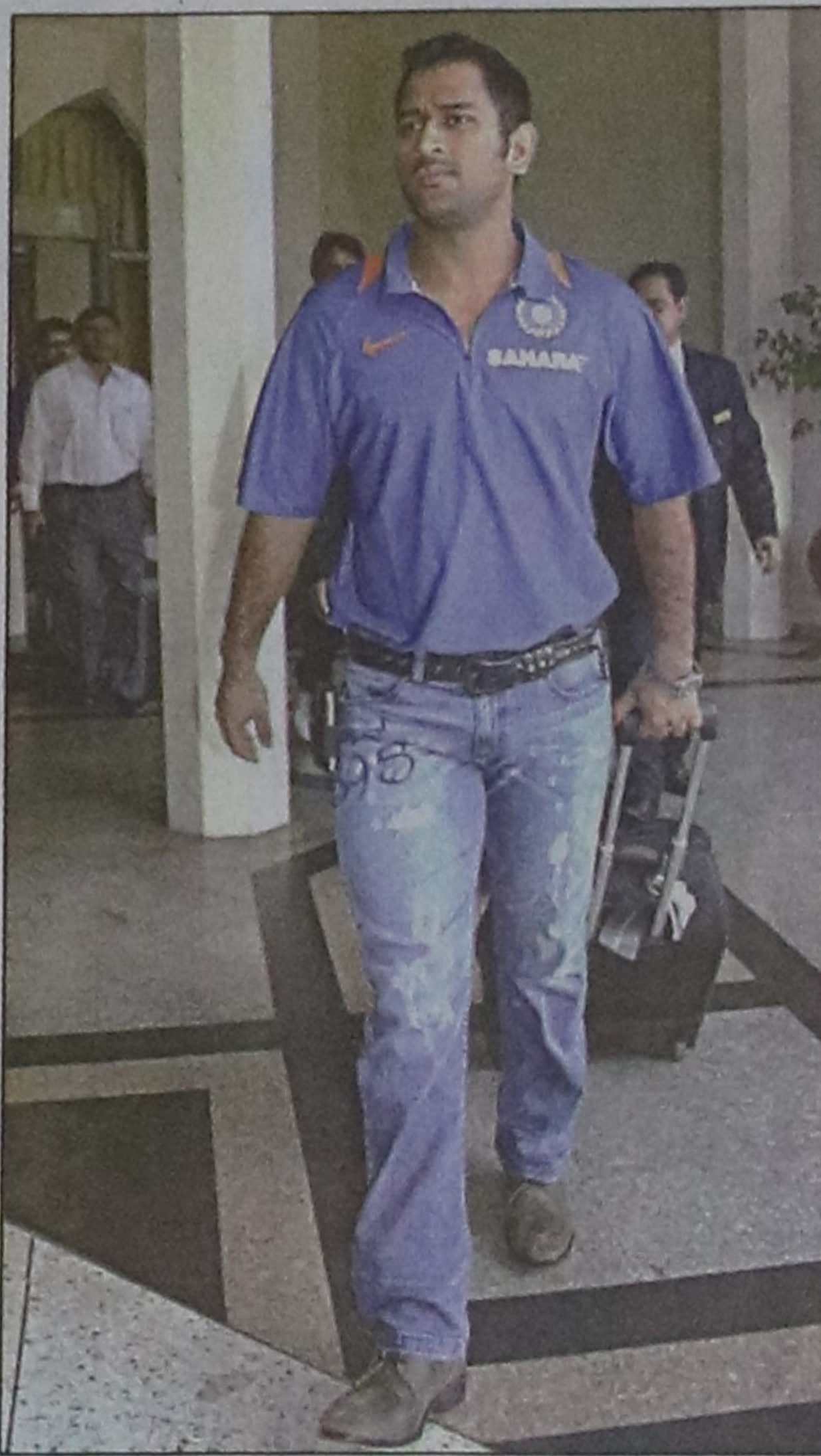
A stone-faced India captain Mahendra Singh Dhoni (L) leaves Sheraton Hotel on way home while (R) Pakistan fast bowler Sohail Tanveer (C) obliges two autograph hunters at the same hotel in Dhaka yesterday, a day after their 25-run win against India in the Kitiy Cup final.