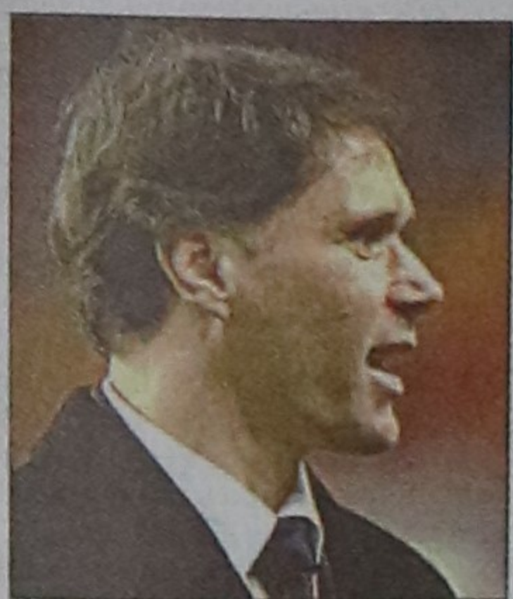
Marco van Basten

(Dutch football coach) "We are very happy to have beaten the world champions and the World Cup finalists in the same week."