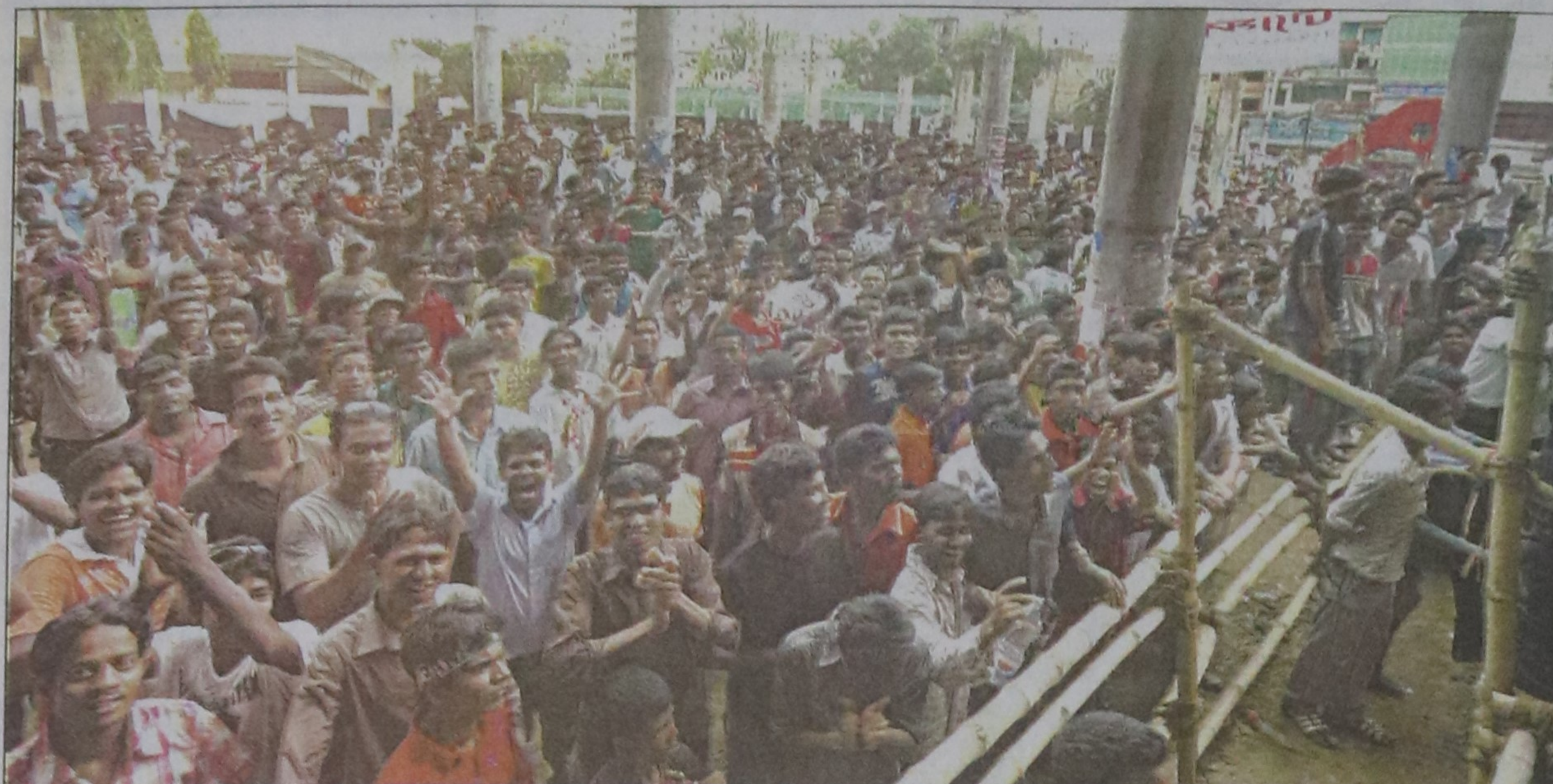
KITPLY CUP COMES ALIVE: With the final of the tri-nation Kitply Cup already underway inside the Sher-e-Bangla National Stadium yesterday afternoon, hundreds are seen waiting outside. The tournament involving India, Pakistan and Bangladesh saw a full house only yesterday.