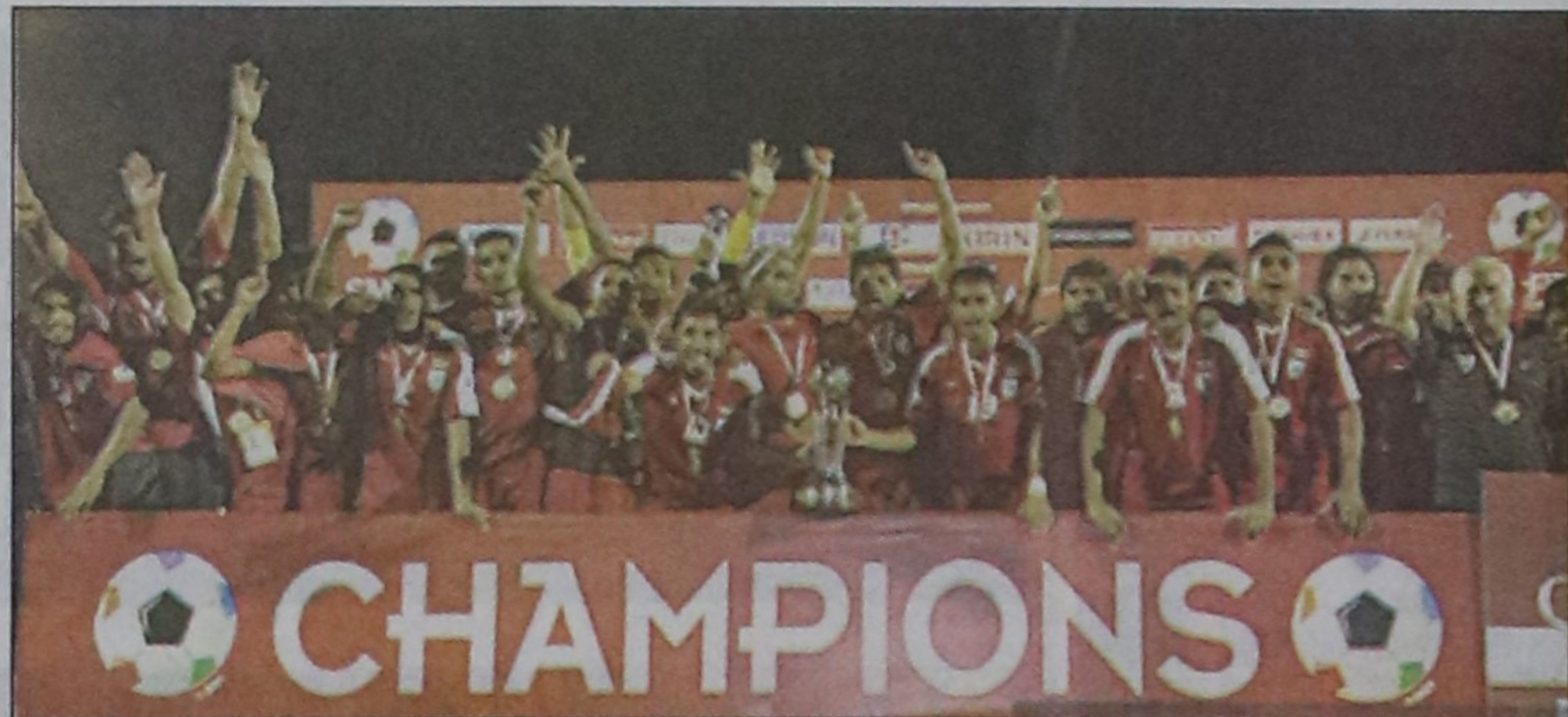
Maldives players celebrate their first-ever SAFF Championship victory after their 1-0 win against India in the final in Colombo yesterday.