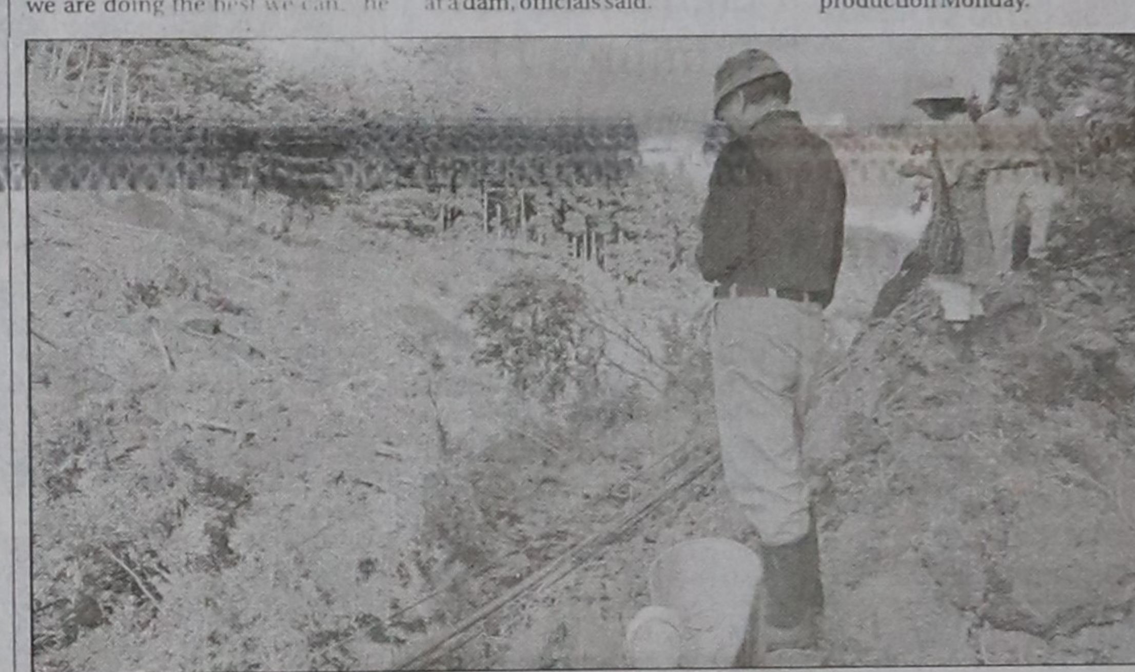
Local residents call their relatives with their mobile phone as a road is blocked by a landslide near Kurihara city in Miyagi prefecture, northern Japan yesterday. A powerful earthquake, 7.2 on the Richter scale, struck northern Japan killing six people, injuring more than 100 more and trapping guests at a hot-spring resort buried by a landslide.

opposition Movement for Democratic Change (MDC) wins the June 27 second round election. The opposition accused authorities of trying to "cripple" their campaign.