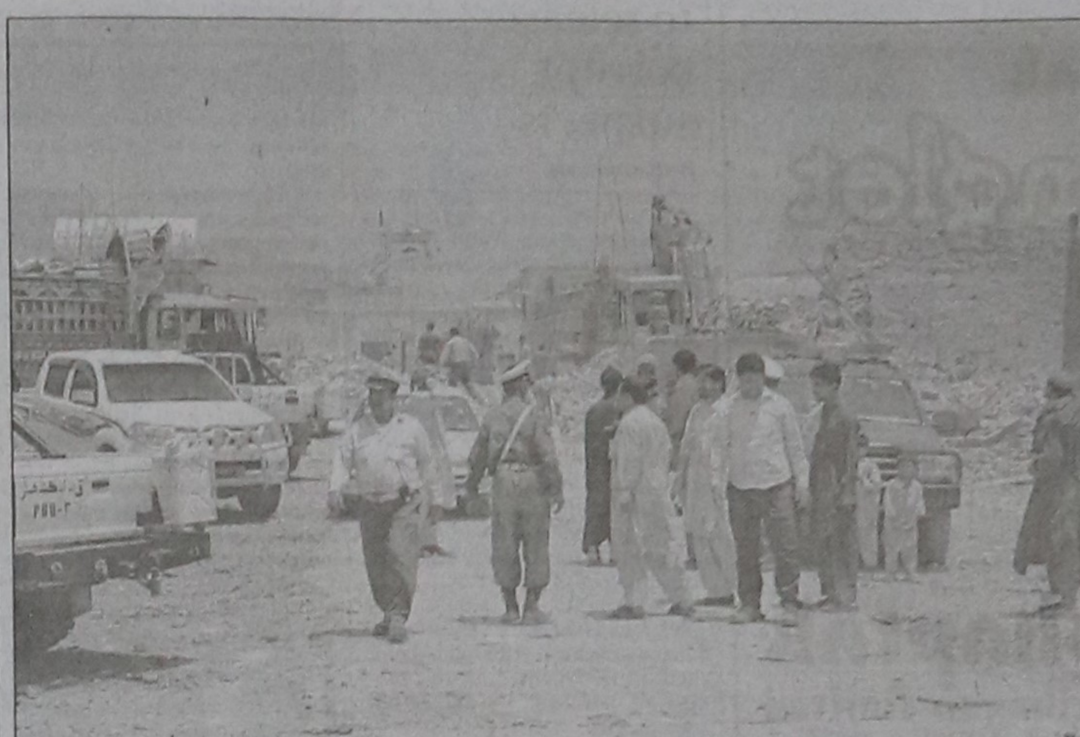
Afghan officials and bystanders walk at the site of a suicide attack in front of the entrance to the main jail in Kandahar yesterday. Taliban rebels blasted into a prison using a suicide car bomb and guns late Friday, freeing as many as 1,100 prisoners and killing at least 15 guards, officials said.

AFP, Taipei The head of Taiwan's top China policy-making body said Saturday the resumption of talks with Beijing "open a new page" in relations between the long-time rivals.