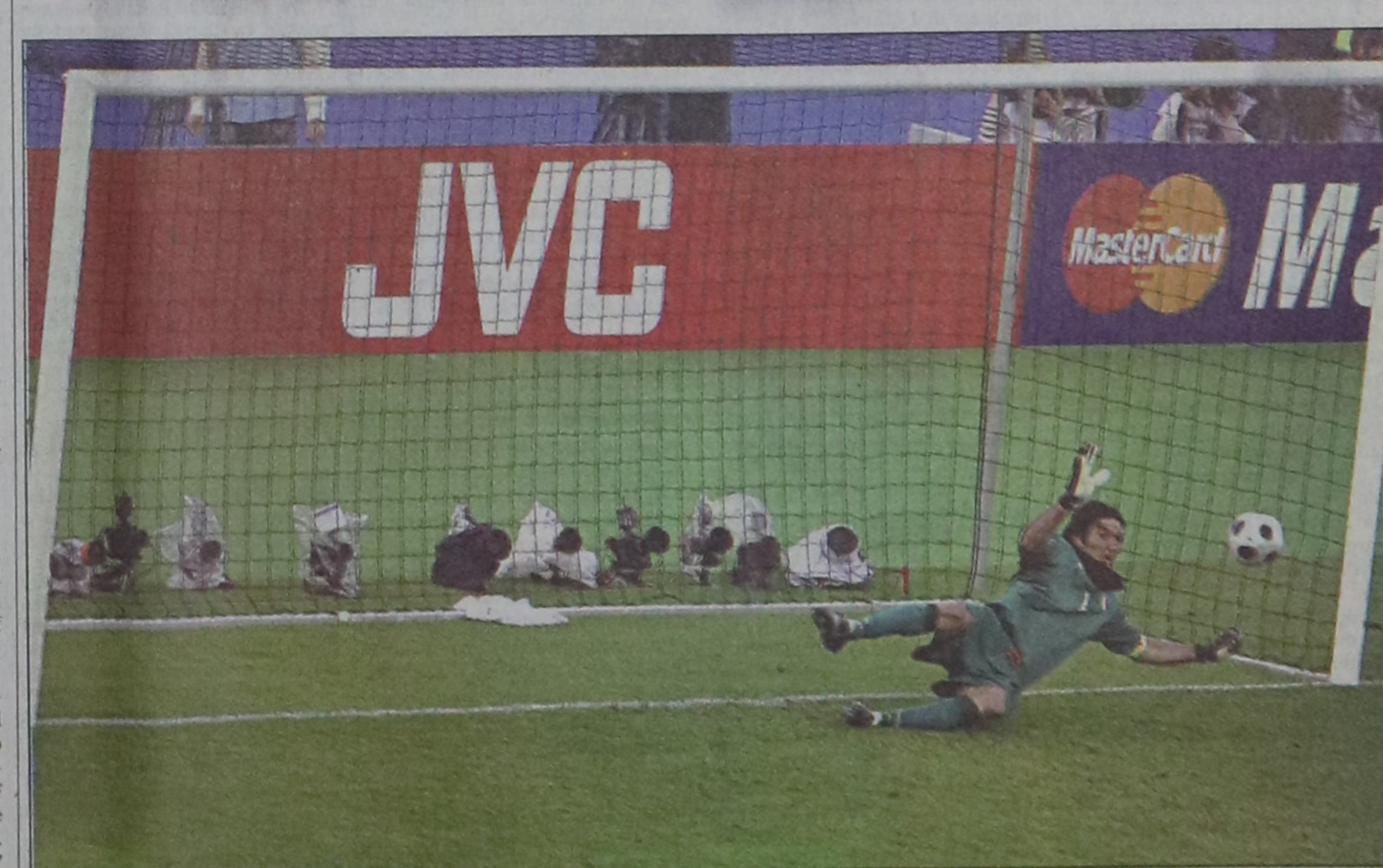
Italian goalkeeper Gianluigi Buffon stops Romanian forward Adrian Mutu's (not in picture) penalty shot during their Euro 2008 Group C football match at the Letzigrund Stadium in Zurich on Friday.