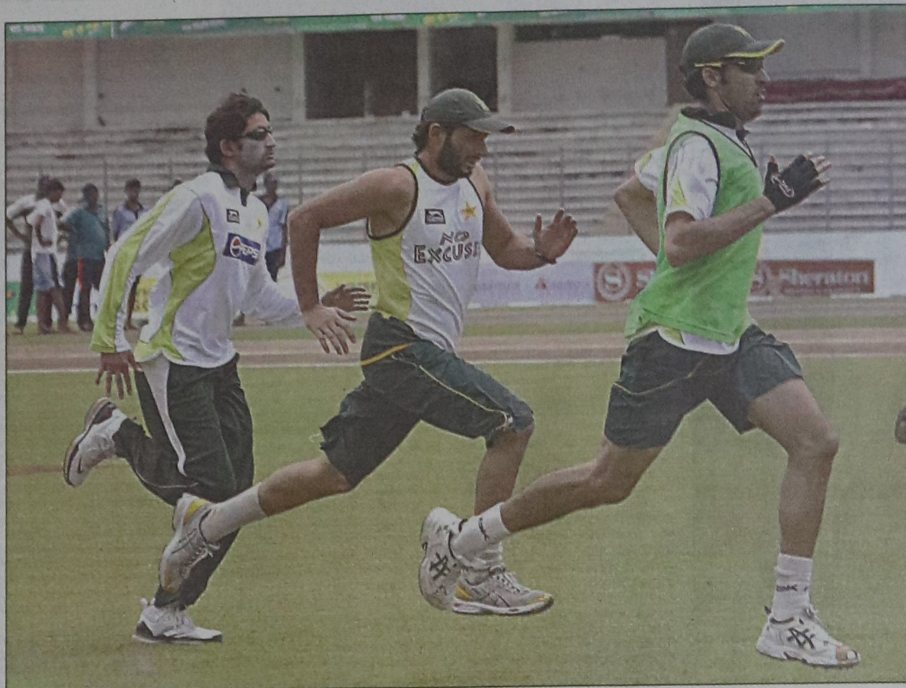
Pakistan's Umar Gul (R), Shahid Afridi (C) and Sohail Tanvir sprint yesterday at the Sher-e-Bangla National Stadium during training on the eve of the Kitply Cup final against India.