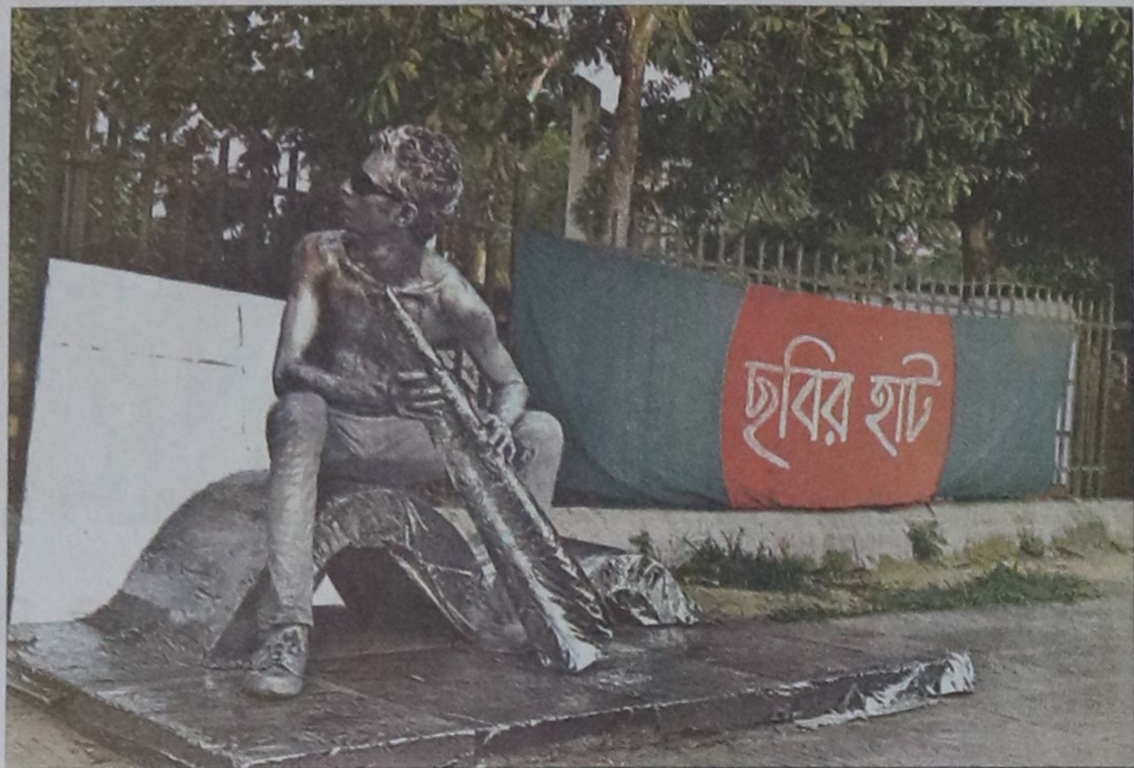
Chhobir Haat is open to all on Fridays, from morning till evening