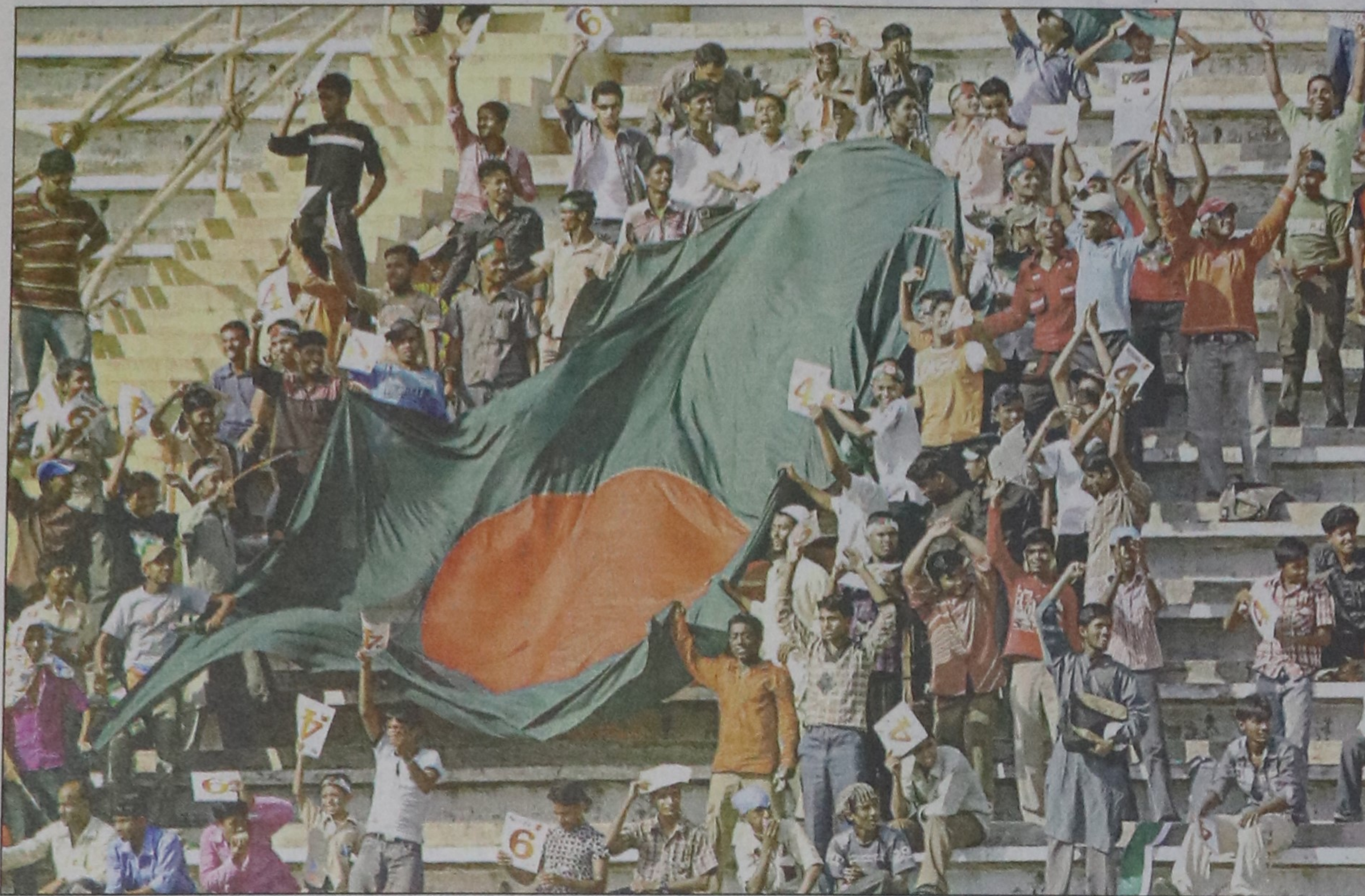
Cricket fans wave their beloved red and green flag during the Bangladesh innings of the Kityply Cup at the Sher-e-Bangla National Stadium yesterday.