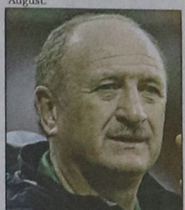
LUIZ FELIPE SCOLARI

Scolari's first competitive game as Chelsea manager will be the first Premier League match of the 2008-09 season on the weekend of 16-17 August.