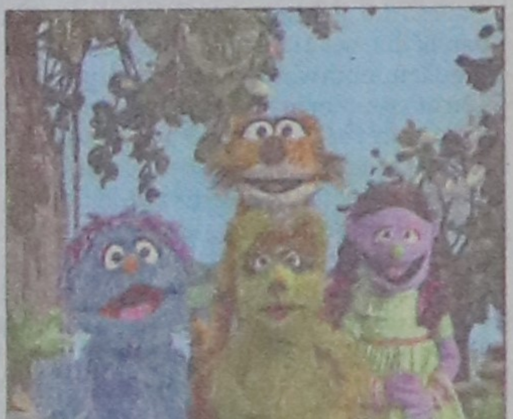
Muppets of Sisimpur

The 44th episode of Sisimpur will be aired on BTV at 9:05 am. Sisimpur is the Bangladeshi adaptation of children's television series Sesame Street . Today's episode will feature various happenings in the lives of the inhabitants of Sisimpur such as Ikri , Tuktuki , Elmo and Grover .