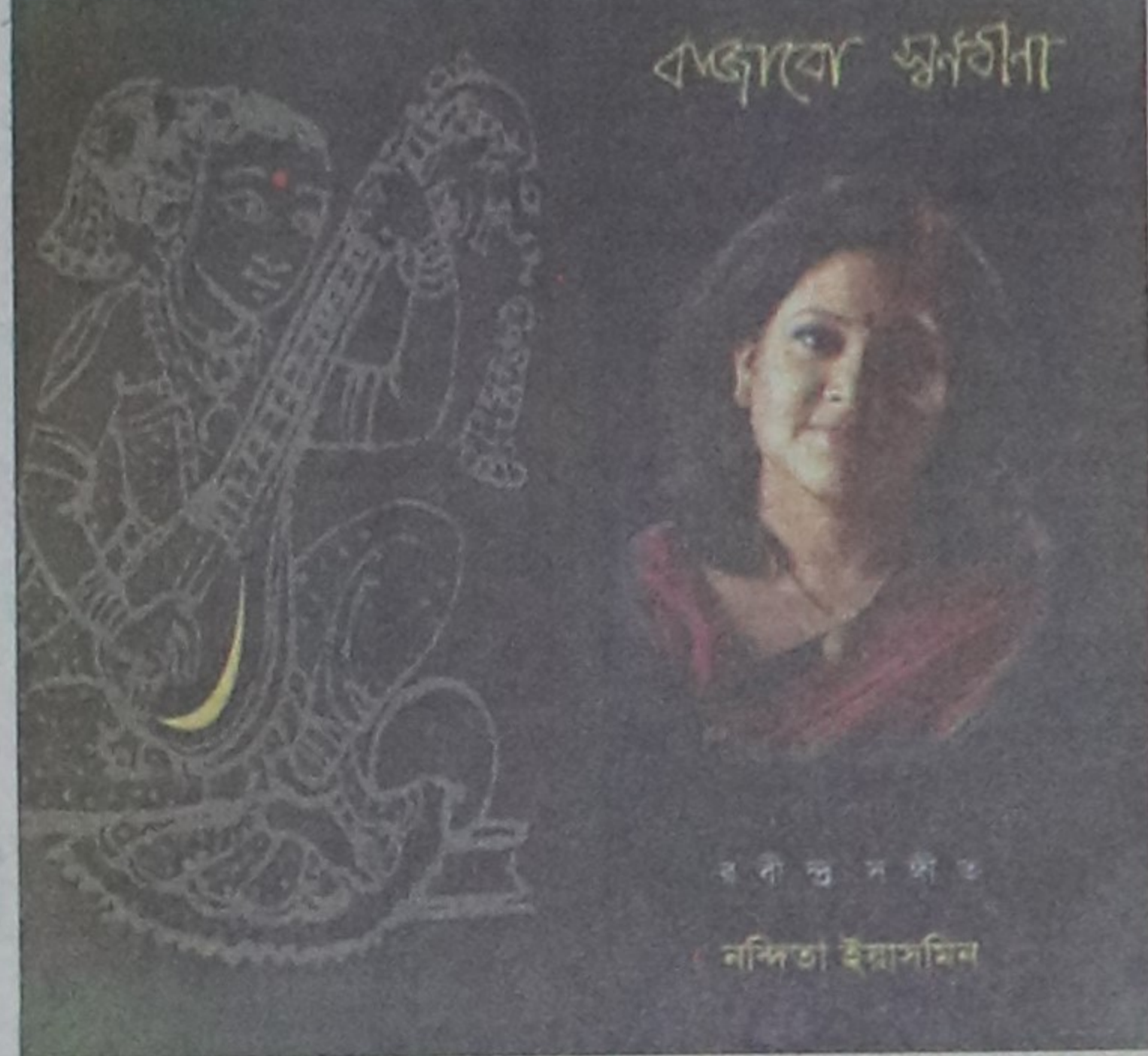
Cover of the album