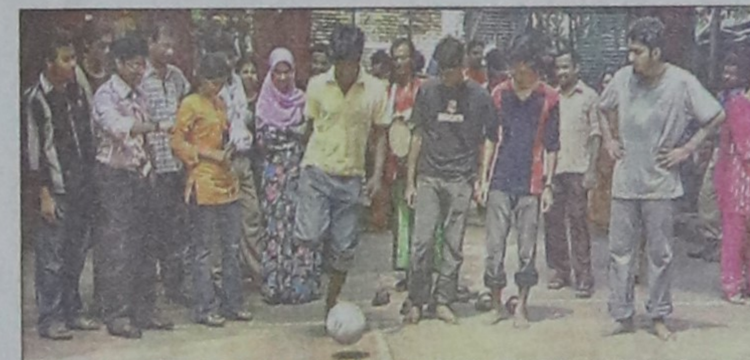
Hosts of the show seen with the participants