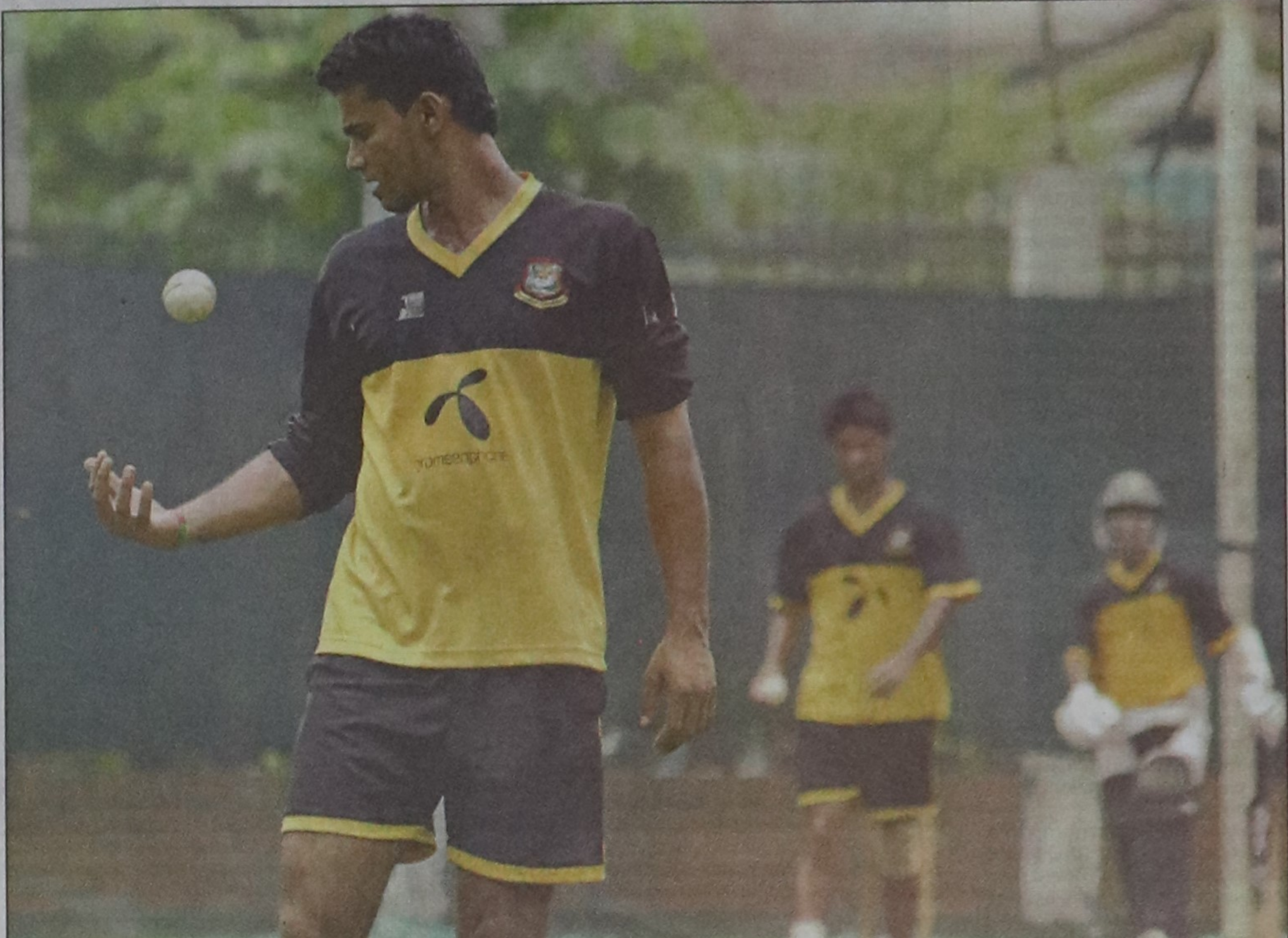
LISTEN TO WHAT I SAY: Pace spearhead Mashrafe Bin Mortaza eyes the white ball during practice yesterday at the Sher-e-Bangla National Stadium ahead of Bangladesh's match against India in the Kitply Cup today. Mashrafe comes into his own whenever he faces the cross-border rivals and his performance can make the difference in today's encounter.