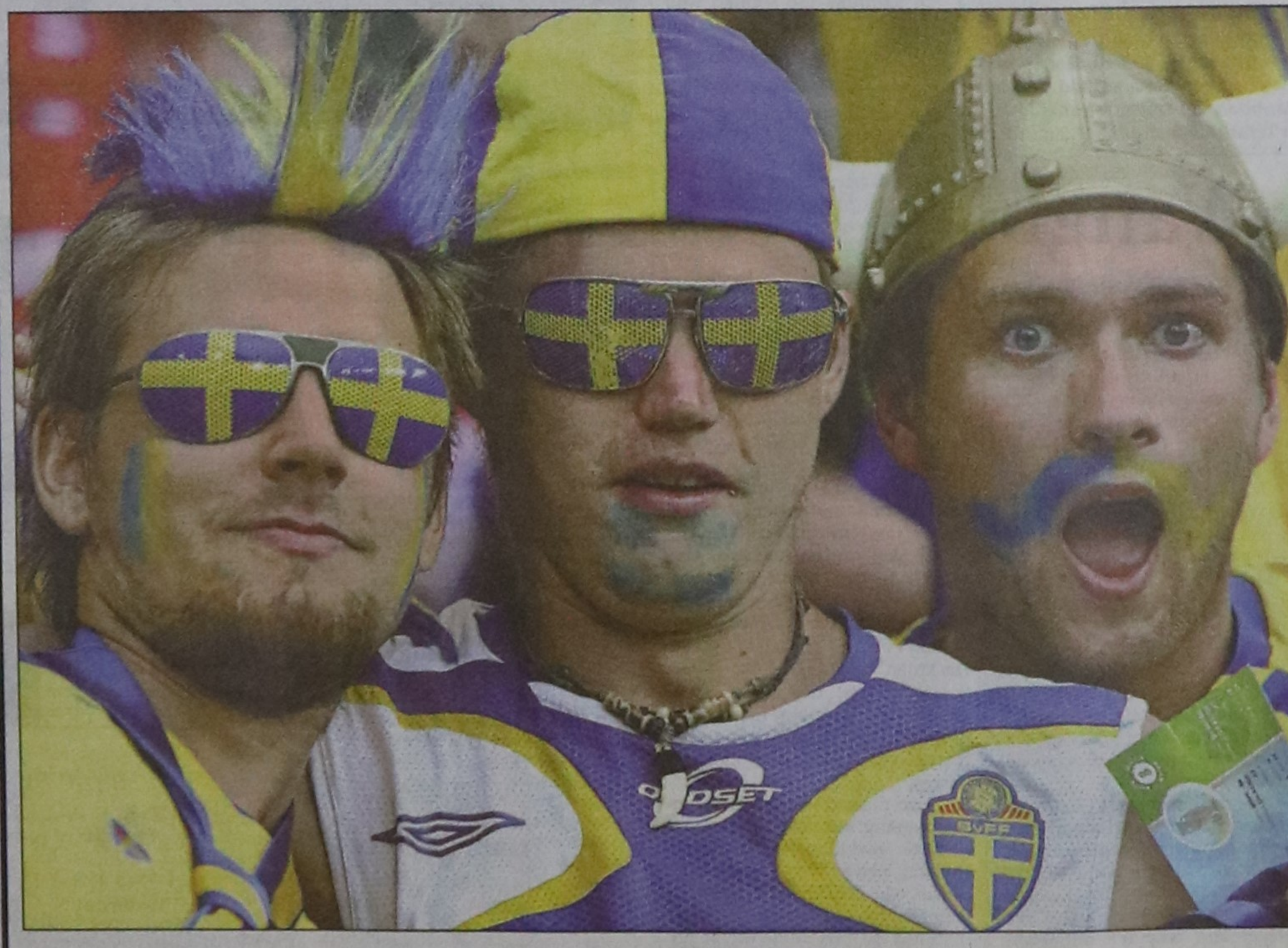
Swedish supporters cheer in the stands before their match against Greece in Salzburg on Tuesday.