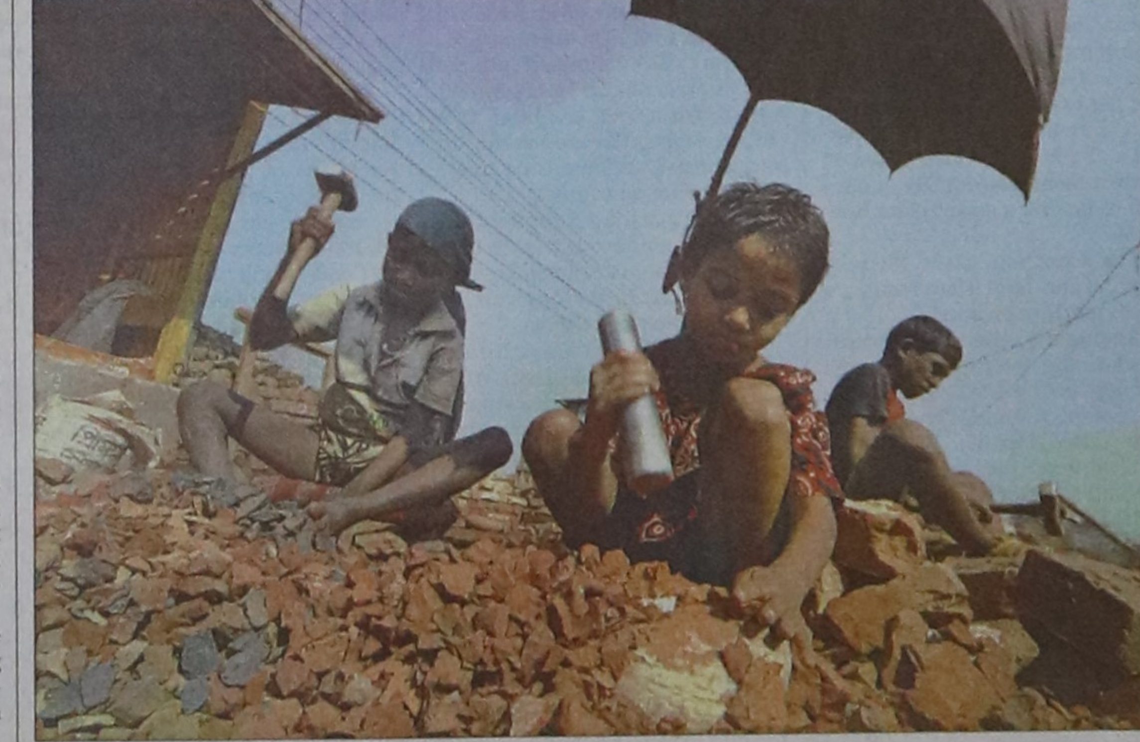
Children, oblivious to their fundamental rights, break bricks at a construction site in the city as the world observes World Day Against Child Labour today. This year the day is being marked with activities to raise awareness that Education is the Right Response to Child Labour.

Fifty-three more Bangladeshis, who served two years' imprisonment in Indian jails, were handed over to Bangladesh authorities by BSF at Benapole checkpoint Wednesday, raising such returnees to 162 in the last three days. Sources said the Bangladeshis who went to India two years back in search of jobs were arrested by Indian police and then sent to jails. The BSF handed over them to BDR and police as Bangladesh Mohila Ainjibi Samity has arranged their return from India through contact with the prison authorities of Damdam in Kolkata. Later, members of the Ainjibi Samity received the Bangladeshis citizens from the police at Benapole Police Station to send them to their family members.