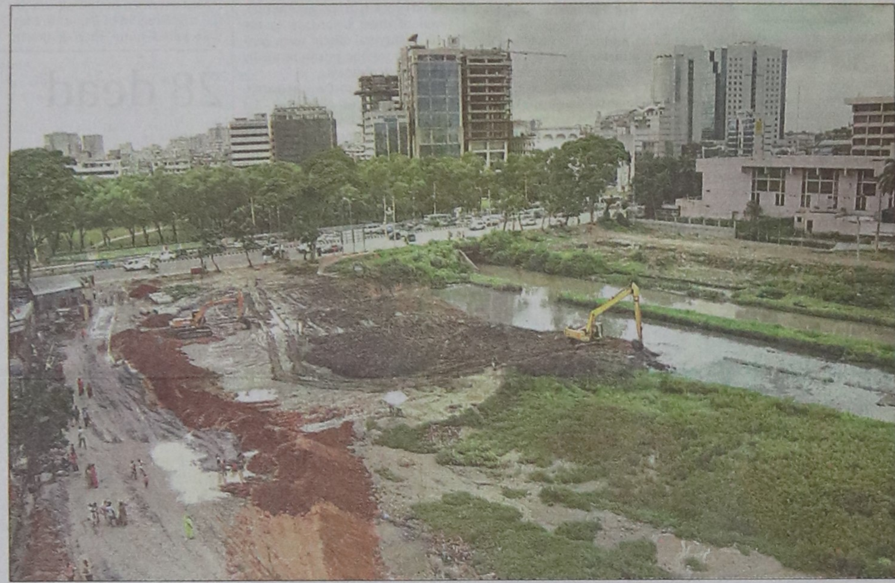
Development work continues in Begunbari canal under a development project in Hatirjheel in the capital and supervised by Bangladesh Army.

memorandum to the chief adviser, demanding the immediate withdrawal of the government approval for the pilot project. On May 23, the government approved the pilot project under which Brac would work to improve overall education and classroom environment in the 20 upazilas by training teachers and making school management committees (SMC) more effective. Primary teachers say this move would not improve the standard of primary education and they see this move as a plot to gain control and thus commercialise the primary education system in the country. Rebutting the speculations of the teachers, the Brac chief said,