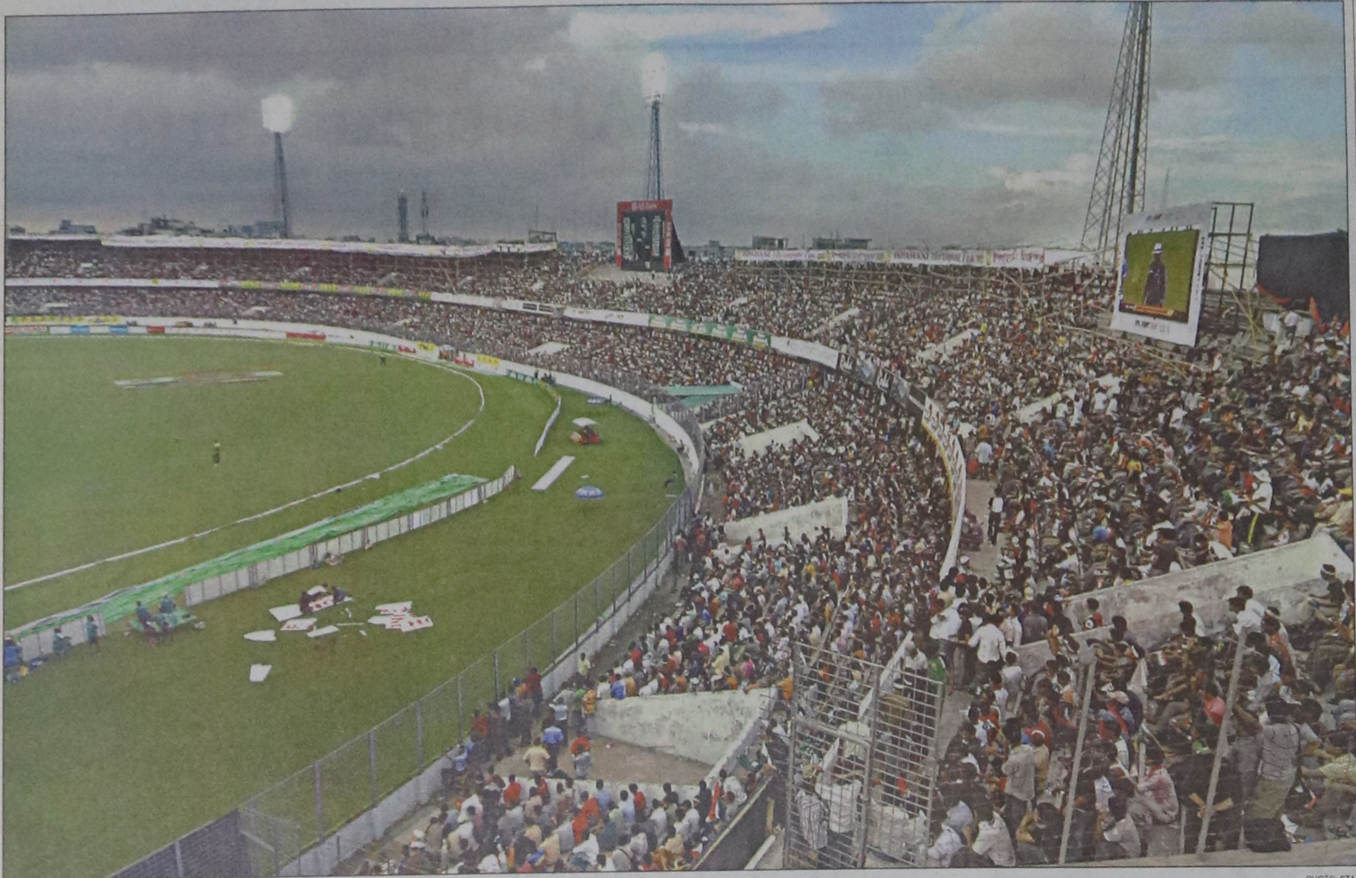
A panoramic view of a portion of the Sher-e-Bangla National Stadium adorned with fans during the crunch India-Pakistan clash yesterday.