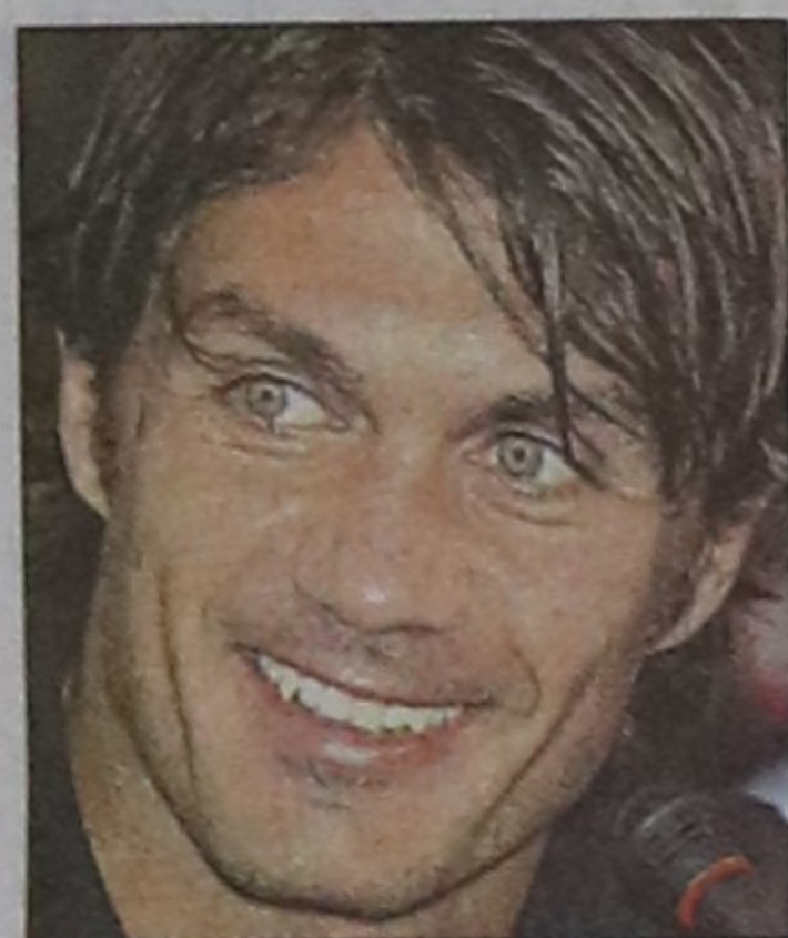
Paolo Maldini (AC Milan's veteran captain) "I like playing football and I believe I can still do it well."