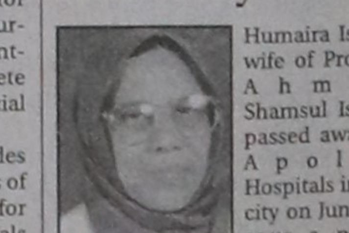
release. A doa mahfil for salvation of the departed soul will be held today after Maghrib prayers at her residence (Sheltech Symphony, House-9, Road-33, Gulshan) in the city.