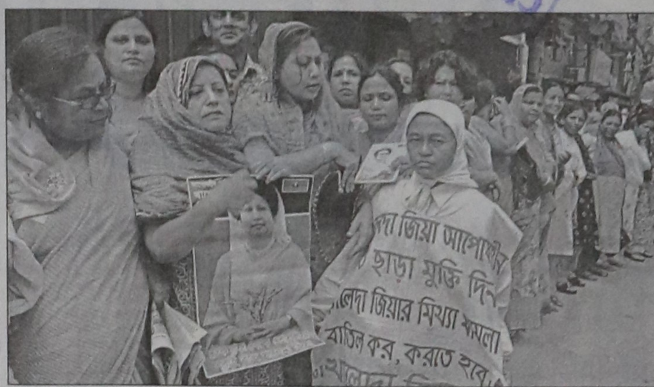
BNP leaders and activists, demanding unconditional release of party Chairperson Khaleda Zia, line up on a road in Sangsad Bhaban area in the city yesterday when Khaleda was taken to a special court.

Similar programme has also been taken in different BAF establishments and base areas. Bangladesh Air Force Women Welfare Association will also take part in tree plantation programme.