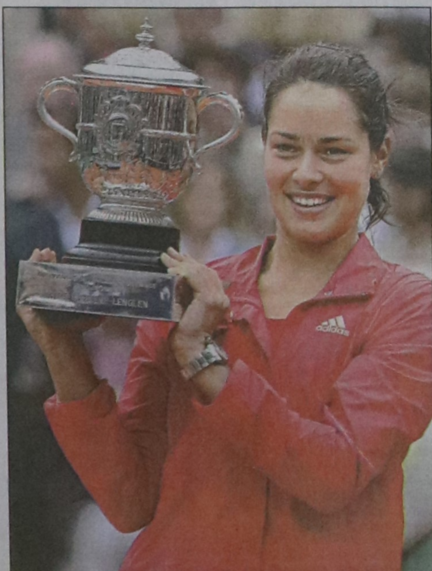
Serbian star Ana Ivanovic holds the winner's trophy after beating Russian Dinara Safina in the French Open final at Roland Garros in Paris yesterday.