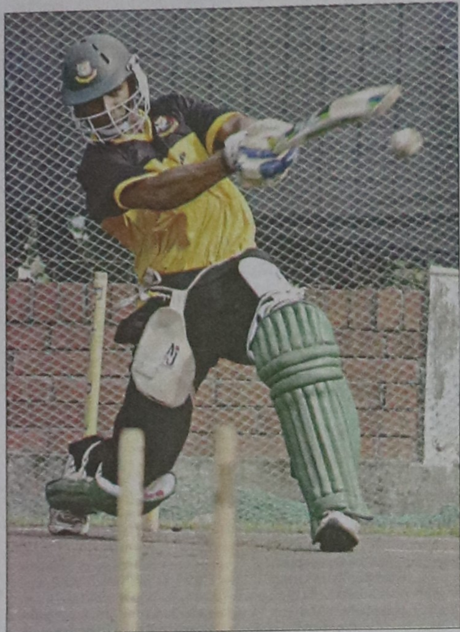
Bangladesh all-rounder Mahmudullah Riyad pulls a long-hop at the Sher-e-Bangla National Stadium nets yesterday during a training session on the eve of their Kityly Cup opener against Pakistan.