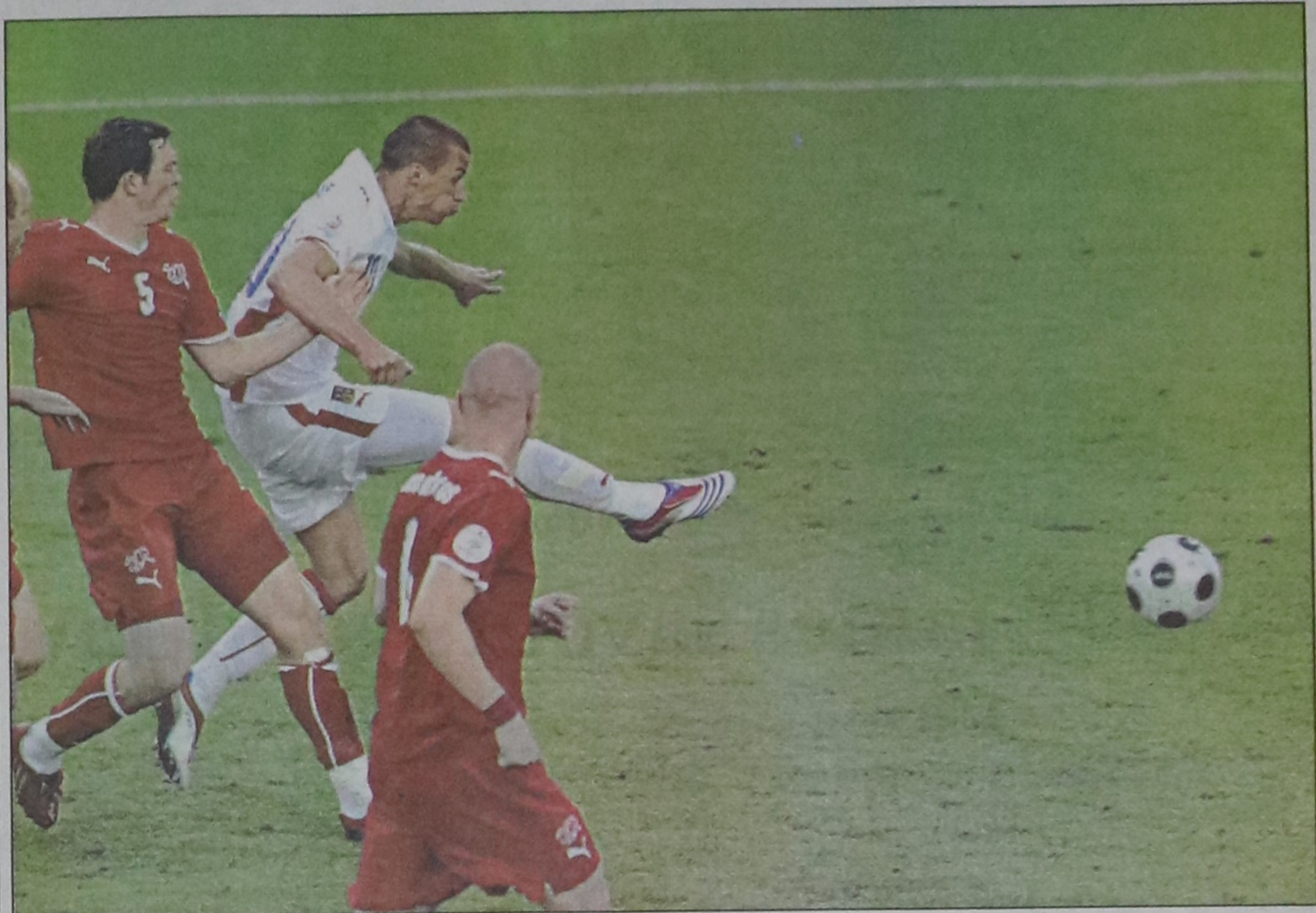
Czech Republic super-sub Vaclav Sverkos (L) volleys home the all-important goal against co-host Switzerland in the opening match of the Euro 2008 at St Jakob-Park in Basel on Saturday.