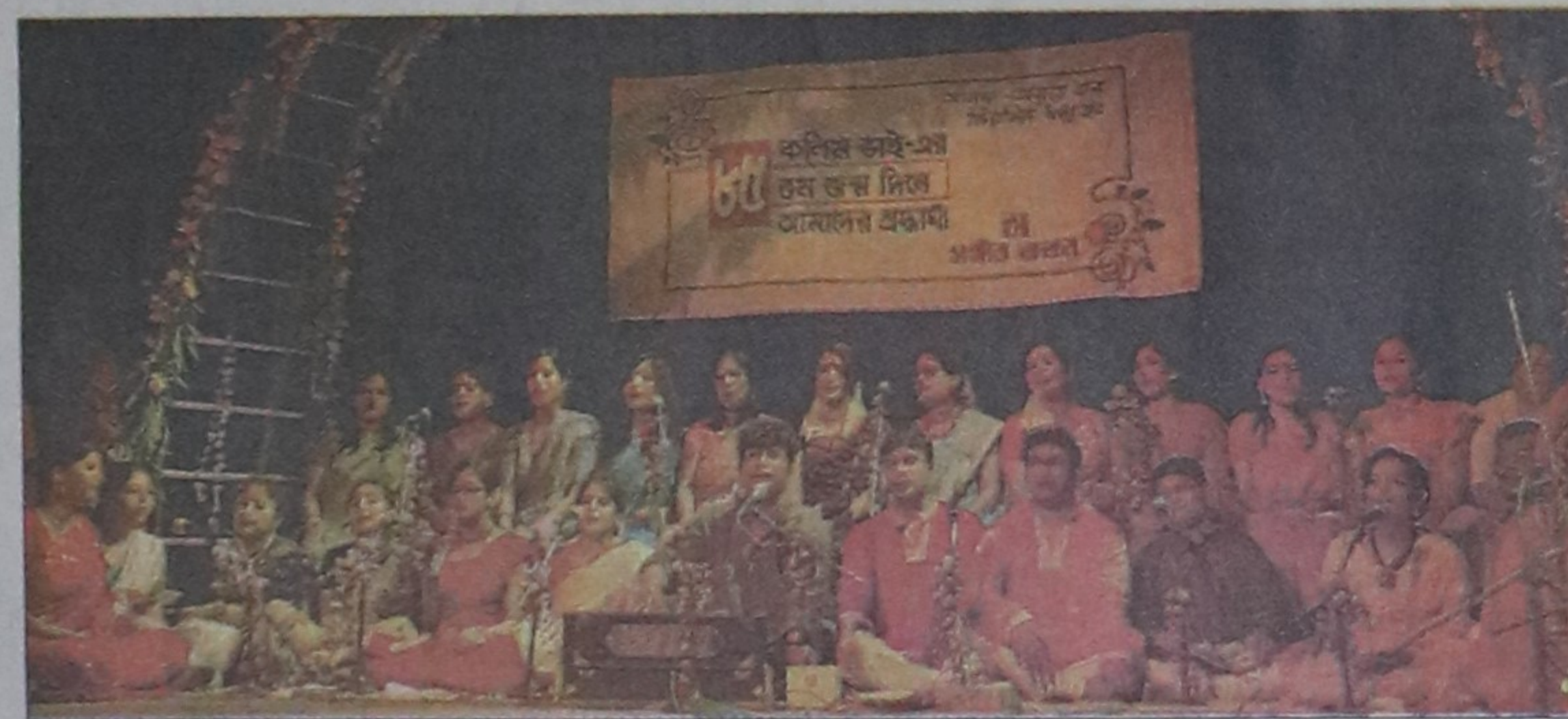
Artistes of the organisation present a choral rendition at the programme.