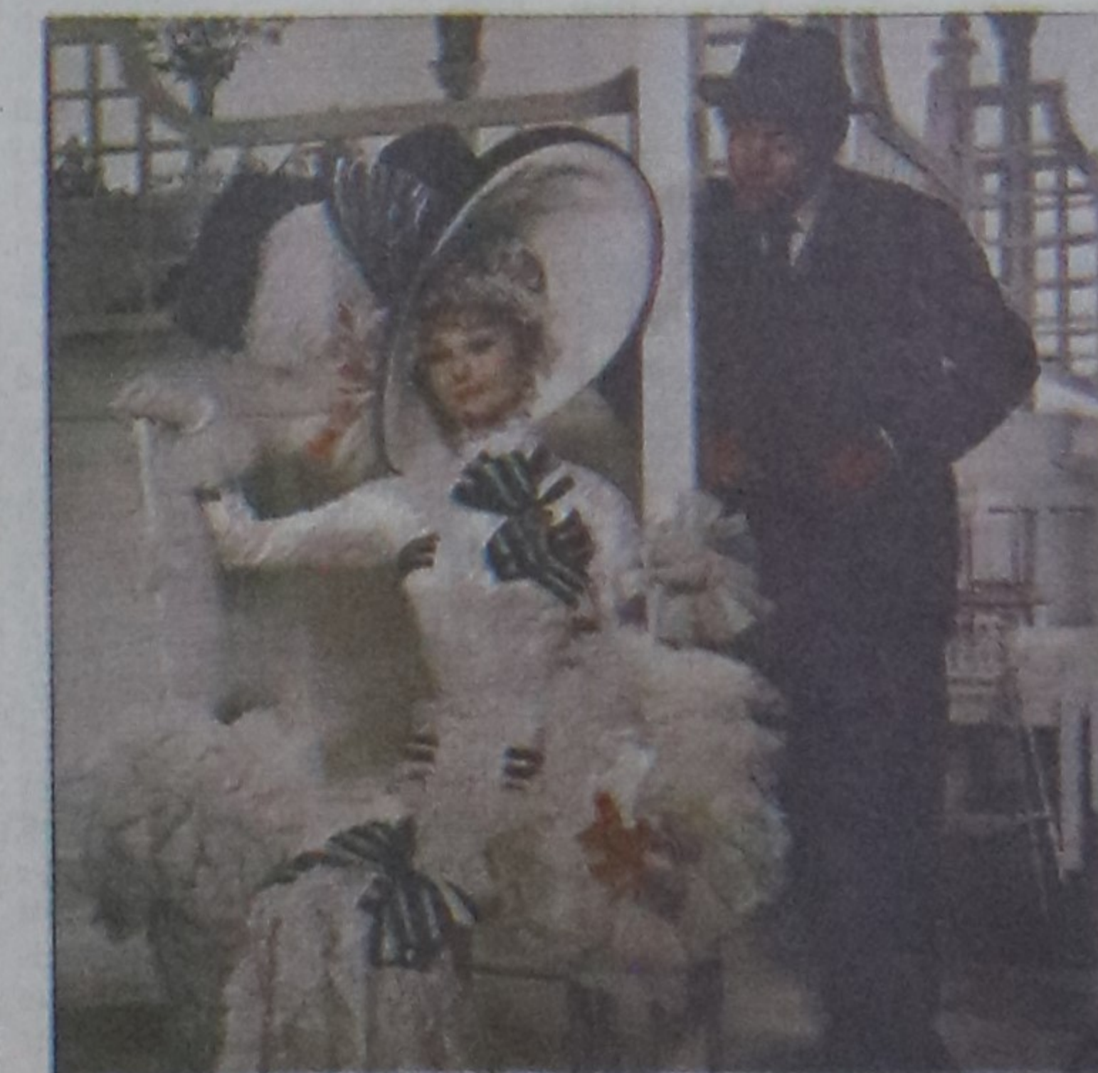
Audrey Hepburn (as Eliza) and Rex Harrison (as Prof. Higgins) in 1964 classic

Applicants must be over 15-years-old, with at least a SSC/O-level certificate. The filled-up form, along with a passport and a stamp sized photograph, have to be submitted at the mentioned outlets. The last date for the submission of the forms is June 23.