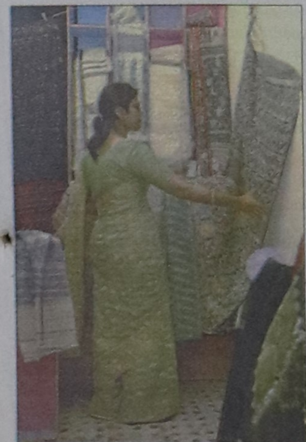
Exquisite Jamdani saris on display