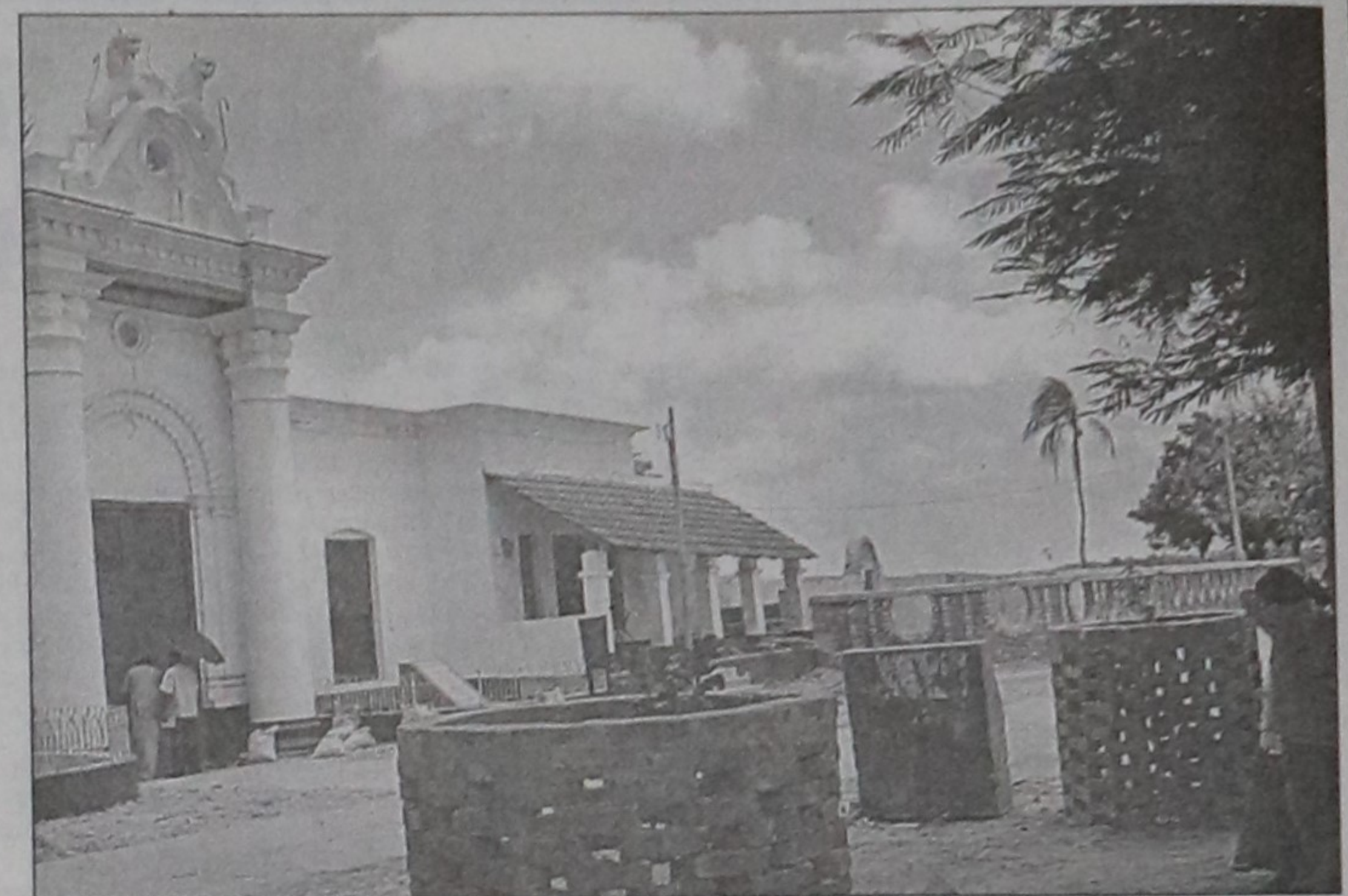
Constructions around poet Rabindranath Tagore's Kacharibari at Patisar in Naogaon.