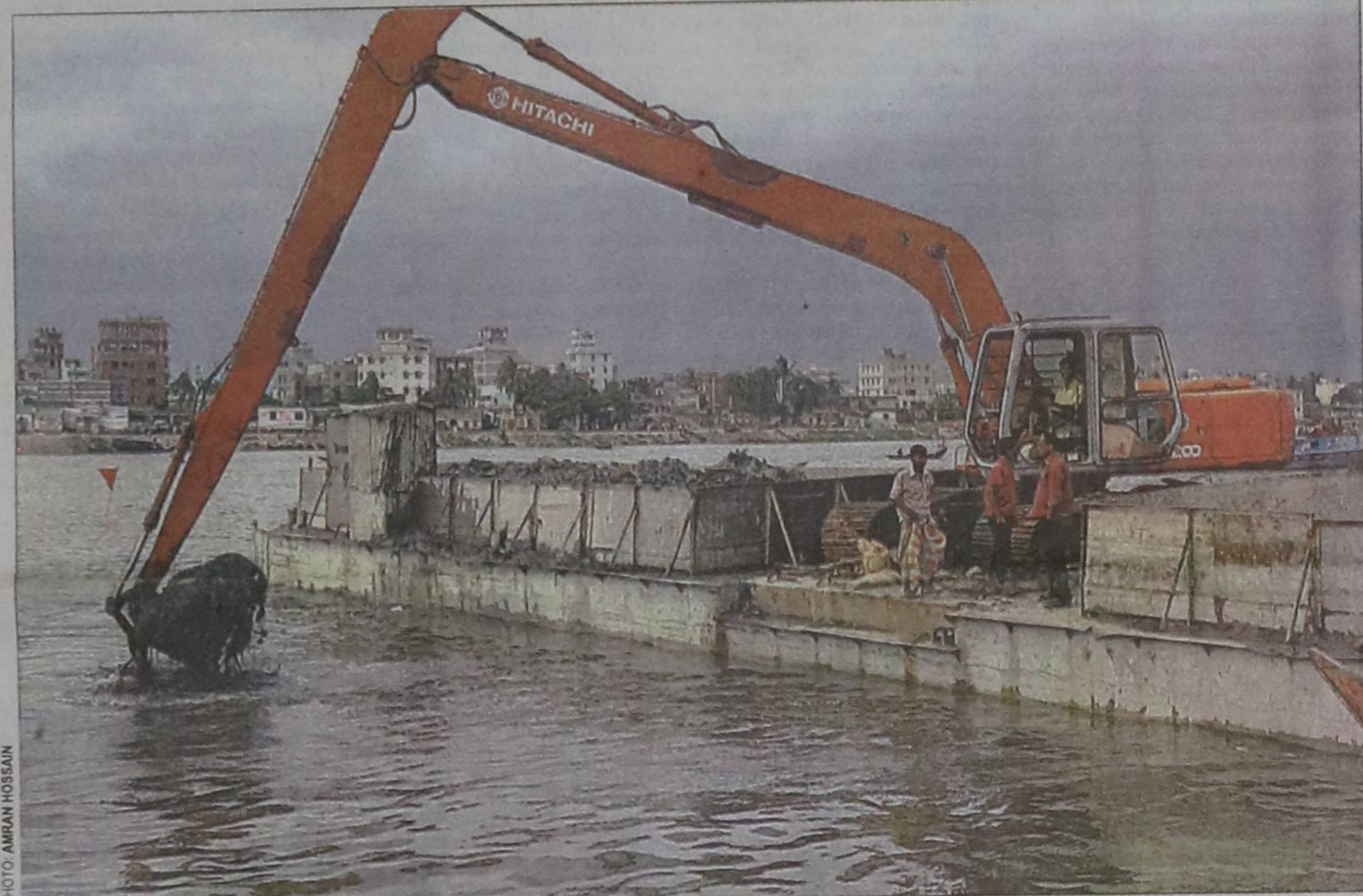
BIWTA places an excavator on a barge instead of using a dredger to maintain navigability in the Buriganga near Lalbagh in the capital. The photo was taken yesterday.