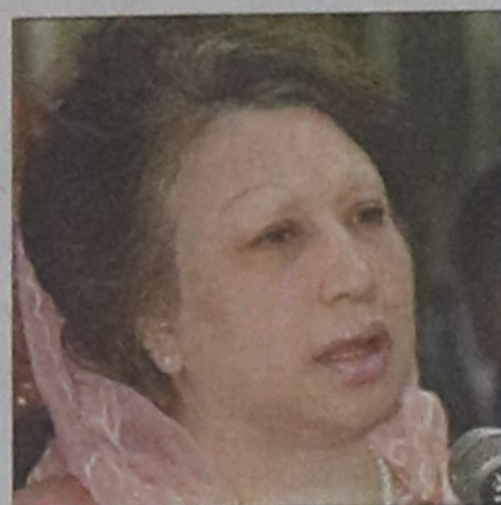
have conducted the mass arrest of political leaders and activists.

Terming the ongoing dialogue "manipulated", she said the government actually does not want the dialogue, otherwise it would not