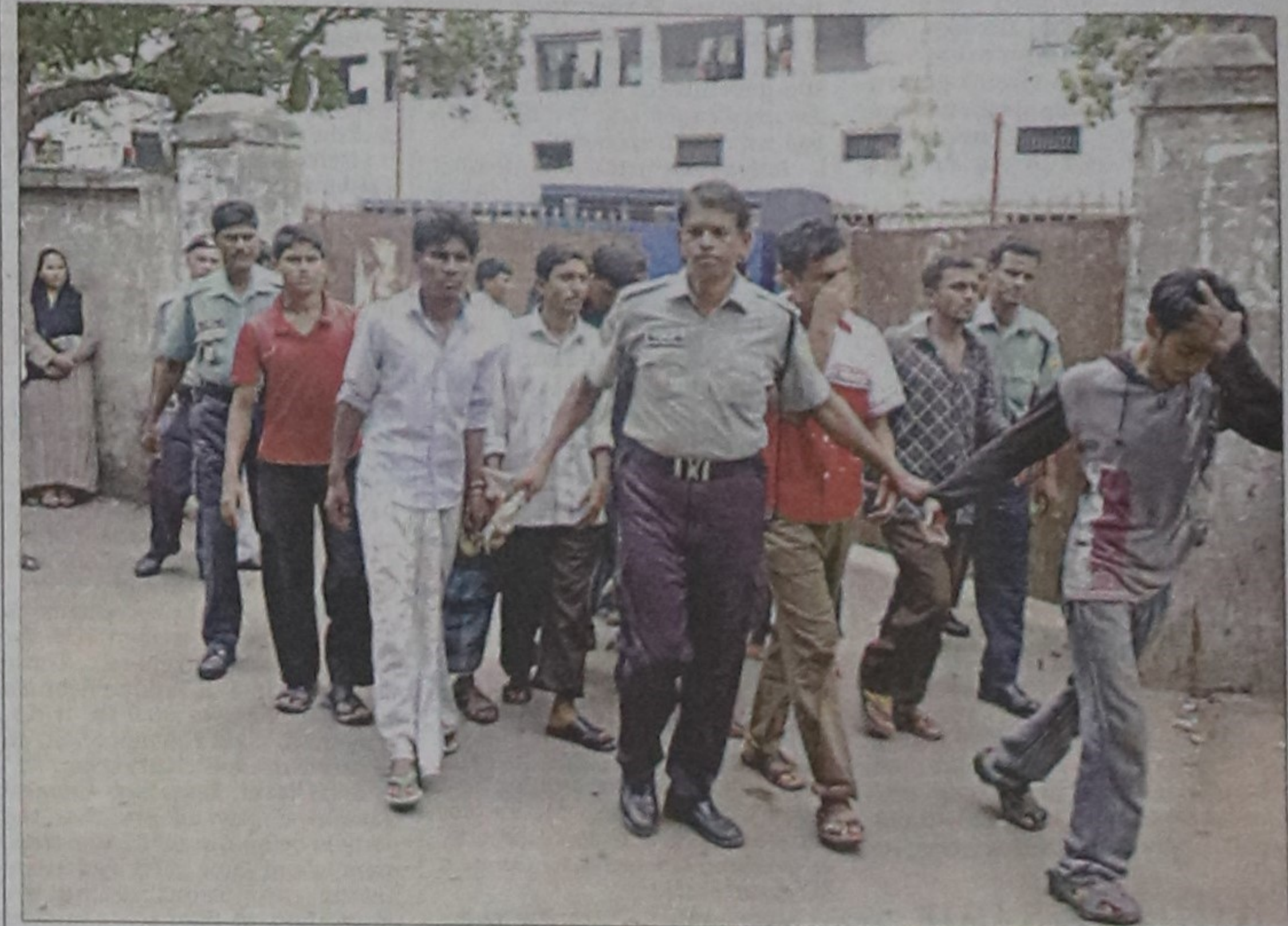
People held during the ongoing mass-arrest drive being taken to the Court of Chief Metropolitan Magistrate, Dhaka under police escort yesterday.

Locals rushed the injured to Ramghar Hospital in Khagrachhari.