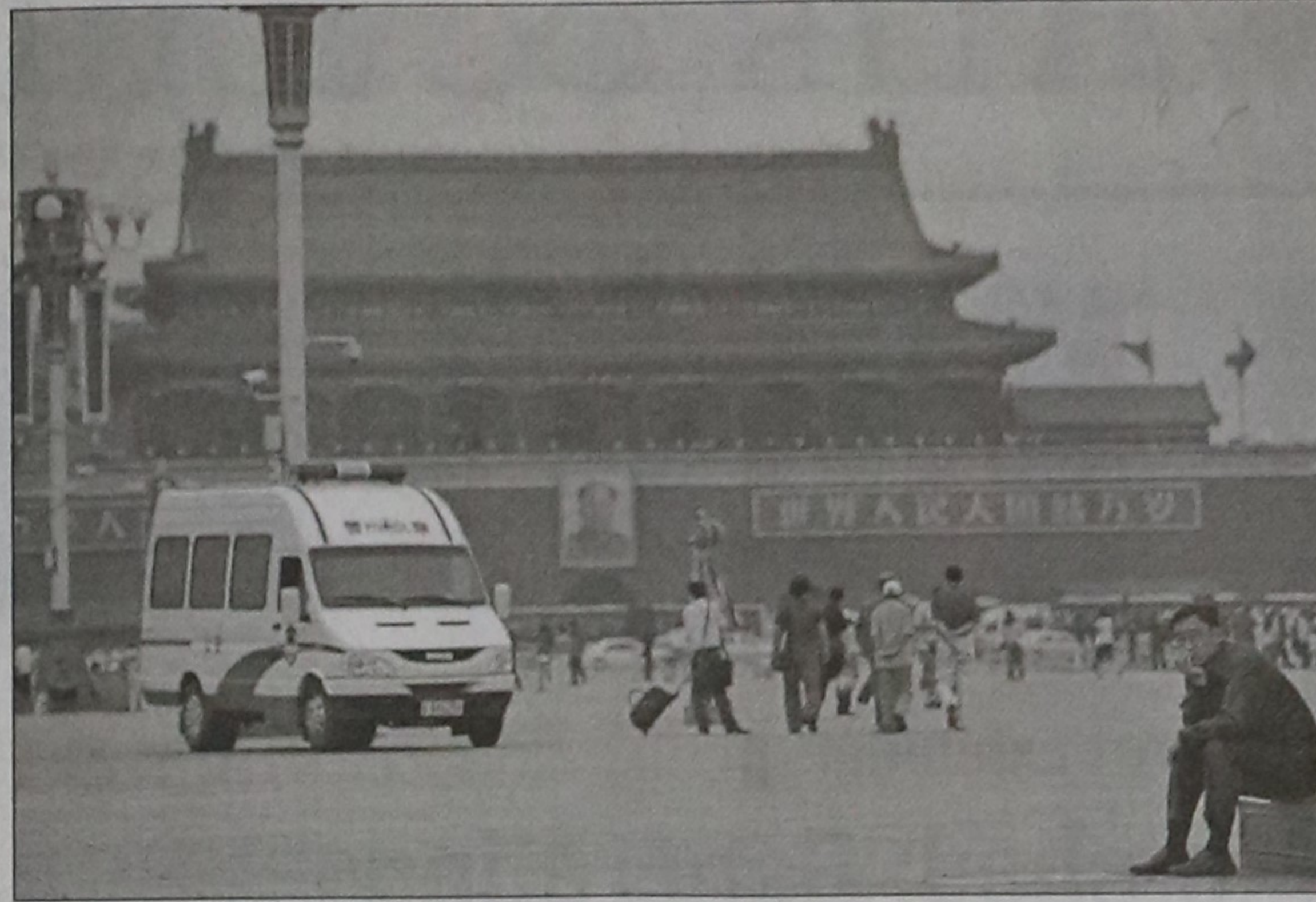
A visitor (R) takes a rest as a police van (L) patrols on Tiananmen Square yesterday ahead of the 19th anniversary of the 1989 crackdown on pro-democracy protests that left hundreds, possibly thousands, dead.

Under a Danish red-and-white flag flying at half mast, Per Stig Møller and other Foreign Ministry staff observed a minute of silence at noon (1000 GMT) in memory of the at least six people killed in Monday's attack.