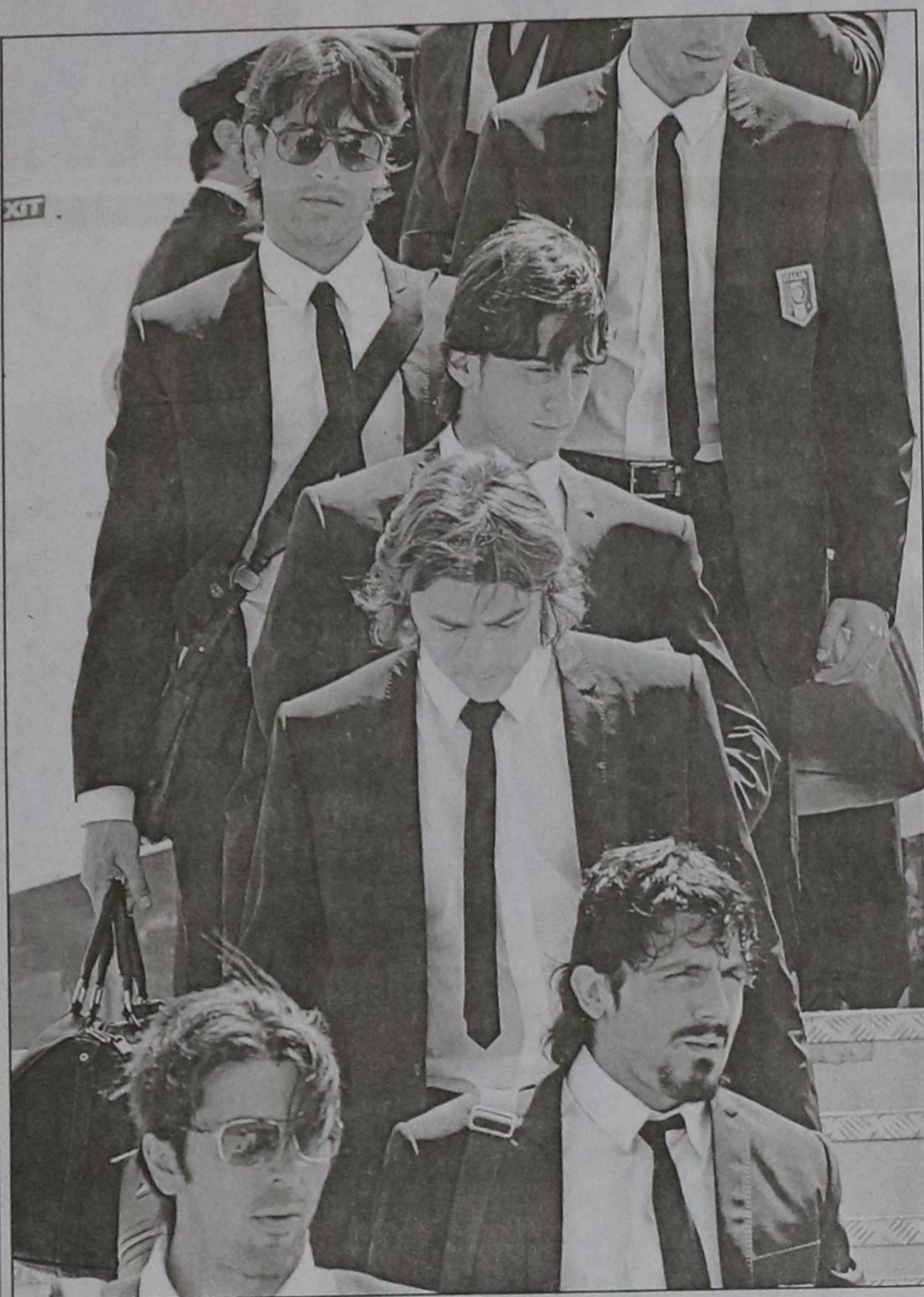
Italian national football team players descend from a plane on their arrival at Vienna's international airport on Monday.