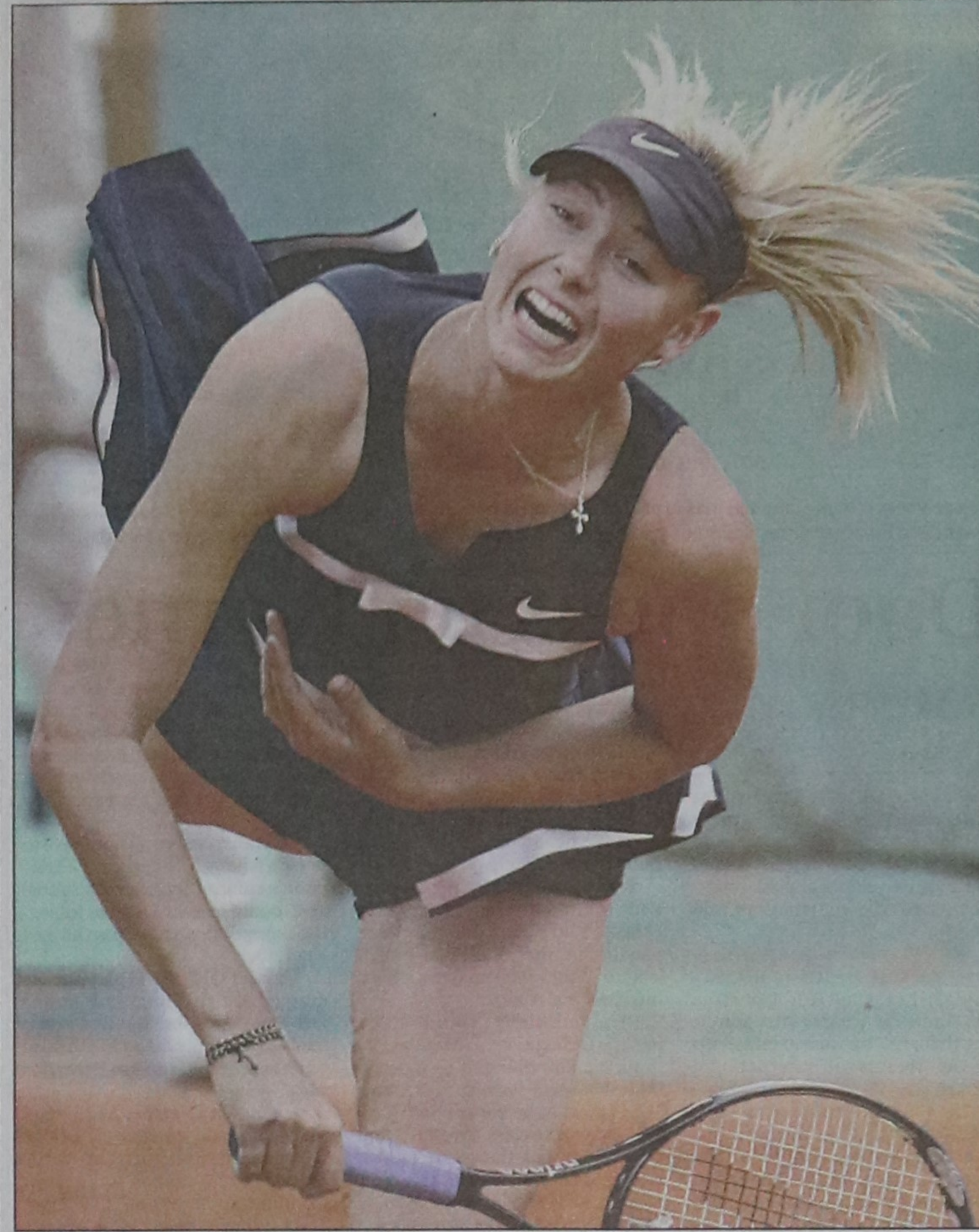
Top-seeded Russian Maria Sharapova serves to compatriot Dina Safina during their fourth round engagement in the French Open at Roland Garros in Paris yesterday. Sharapova however lost the match 7-6, 6-7, 2-6.