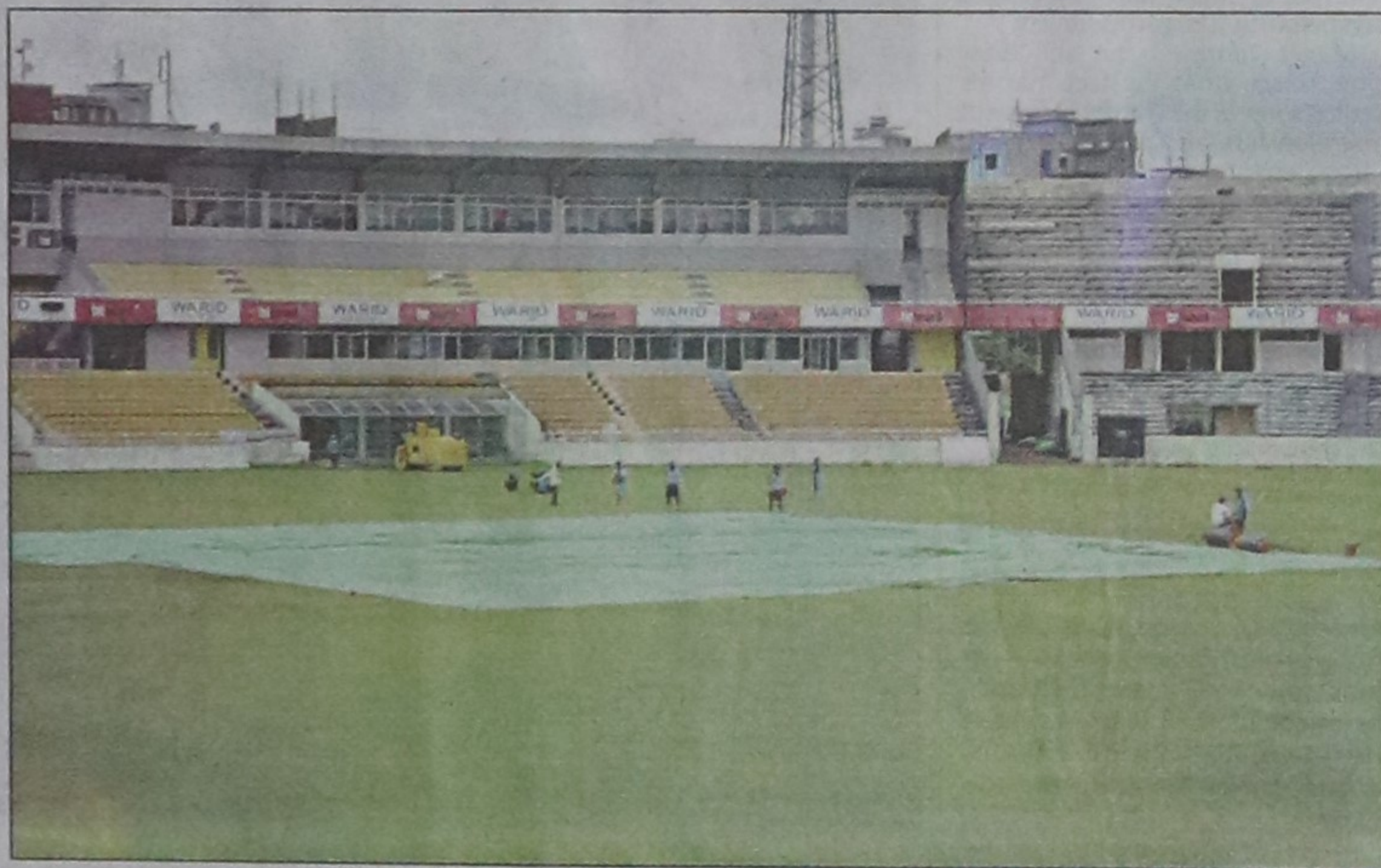
The pitches of the Sher-e-Bangla National Stadium in Mirpur are under covers during yesterday's heavy rains. With the tri-nation one-day series involving India, Pakistan and Bangladesh, due to start on June 8, being organised during this period of year, many fear that such scene could be a daily event.