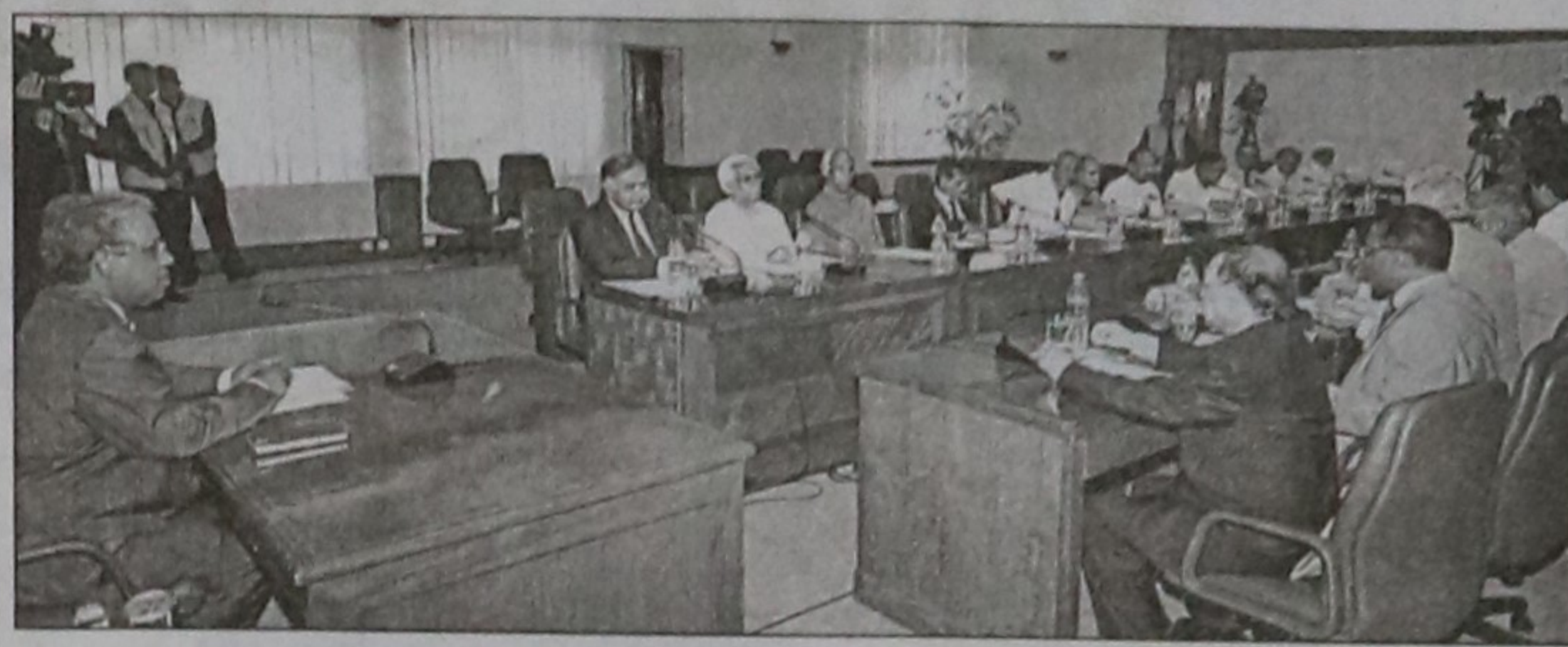
Chief Adviser Fakhruddin Ahmed hold talks with Gono Forum leaders as part of the ongoing dialogue with the political parties at his office in the city yesterday.