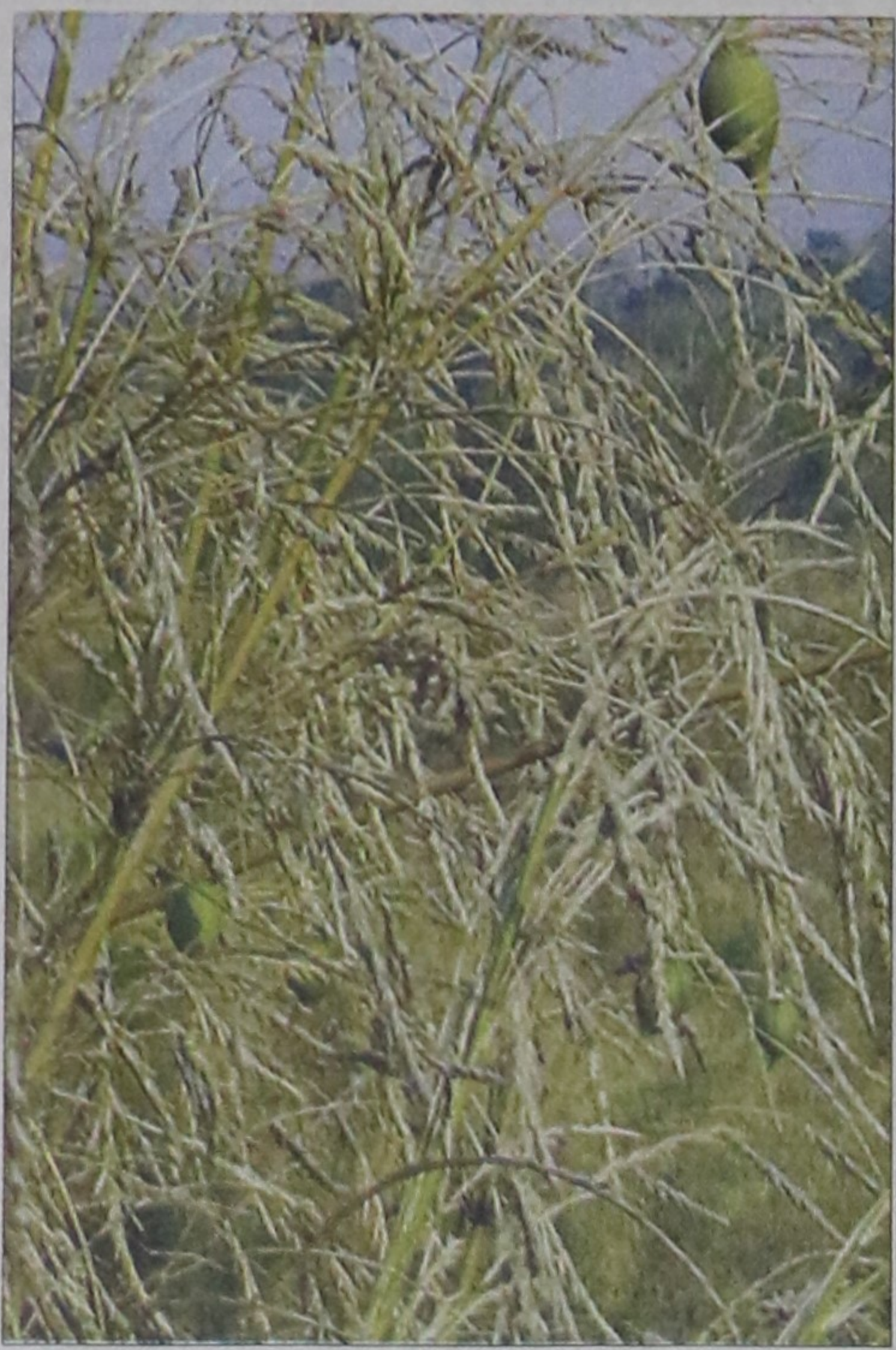
Unusual flowering and fruiting in a bamboo cluster at Sagornal in Juri.

The government earns about Tk one crore yearly revenue from 20 bamboo mohals of Moulvibazar district where 50 thousand labourers are engaged in bamboo mohals, they said.