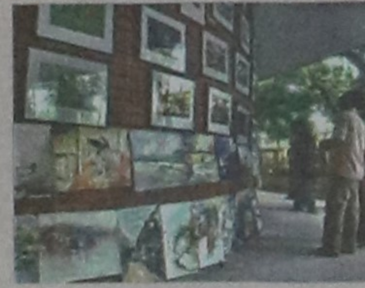
Photo exhibition for Poet Samudra Gupta Organiser: www.bangladeshphotographers.com and IFA students Venue: IFA (Institute of Fine Arts) premises Date: May 29-June 2