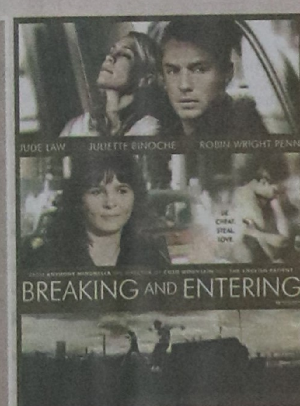
Breaking and Entering On Star Movies at 05:00 pm, Genre: Drama Cast: Jude Law, Martin Freeman, Juliette Binoche