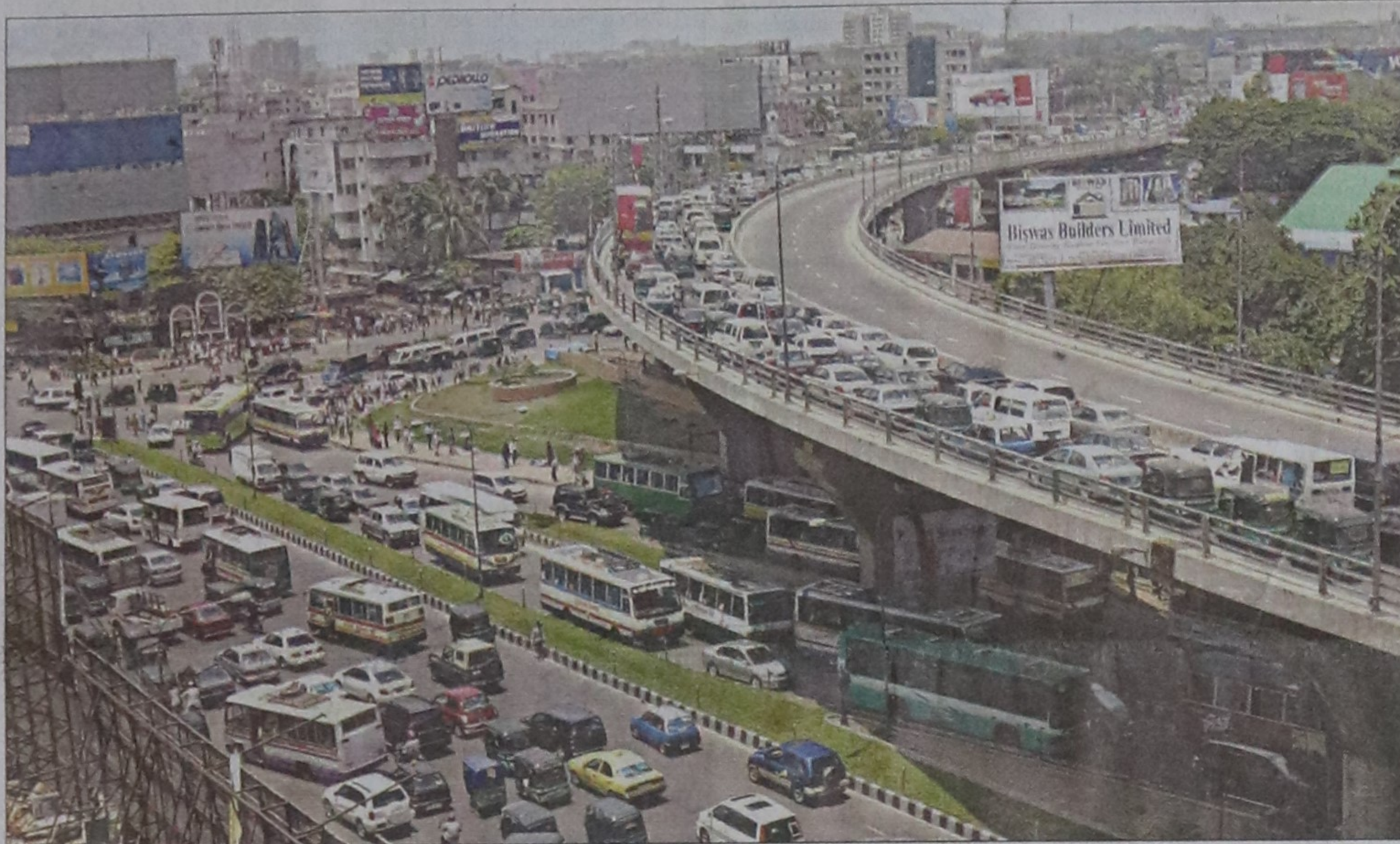
Hundreds of vehicles are stuck in gridlock at Mohakhali yesterday. Closure of Rokeya Sarani from Jatiya Sangsad Bhaban end to Bijoy Sarani for a few hours caused traffic jams on several streets in the capital.