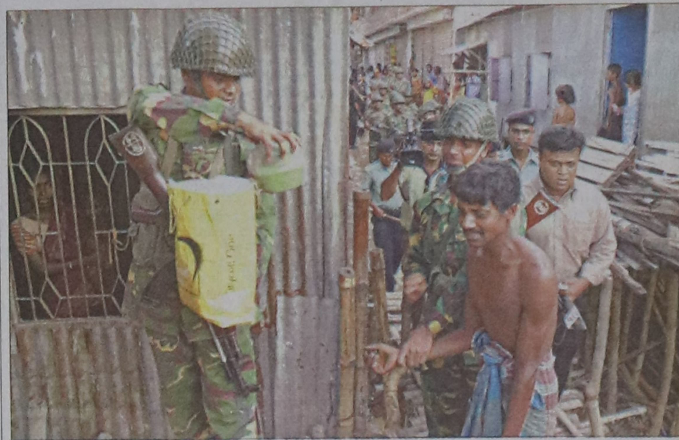
Members of the joint forces pick up a man and search for arms at Hatirjheel of Madhubagh in the capital during a drive yesterday.