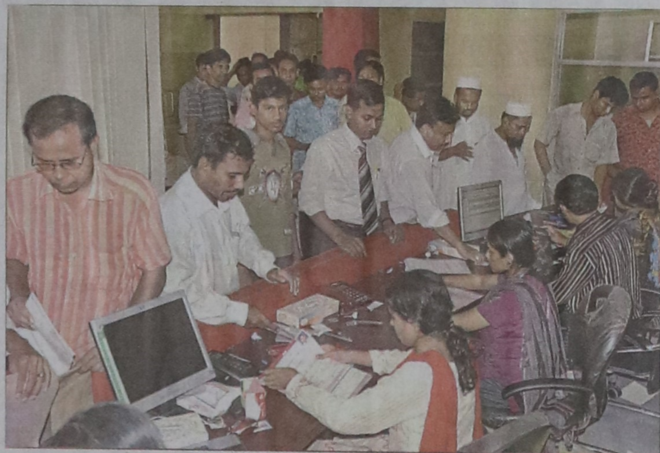
A large number of unregistered mobile phone subscribers crowd a sales centre of TeleTalk in Dhaka as the re-registration deadline expired yesterday.