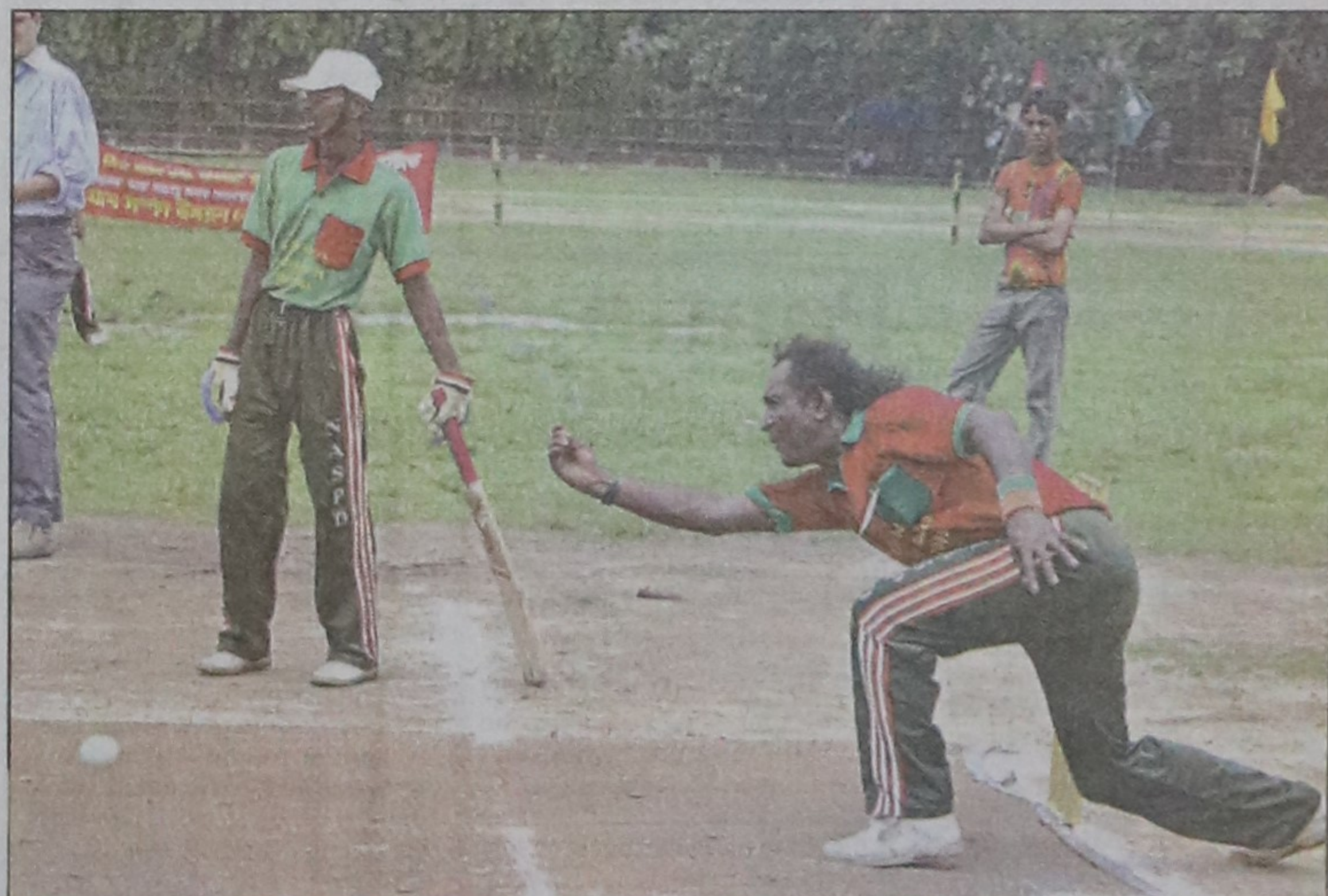
WHO SAYS WE CAN'T PLAY? A visually impaired player bowls during an exhibition cricket match at the Dhanmondi Playground yesterday. The match was organised by the National Association of Sports for the Persons with Disability (NASDP) in association with Action on Disability and Development.