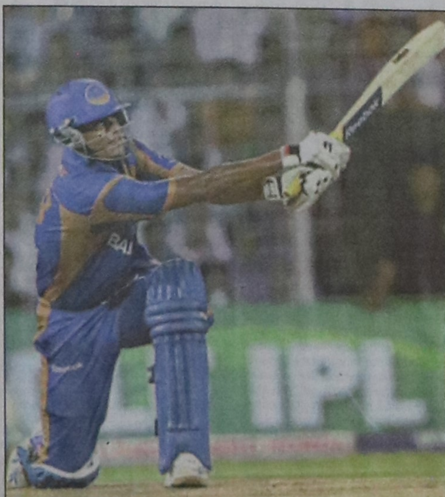
THE ENTERTAINER: Rajasthan Royals' hard-hitting batsman Yusuf Pathan whacks one over mid-wicket during his blistering knock of 45 against Delhi Daredevils in the first semifinal of the Indian Premier League at the Wankhede Stadium in Mumbai on Friday.

"The pitch was obviously very good, so I thought I was going to have as good a chance as any to get across that line. To get it out of the way was great."