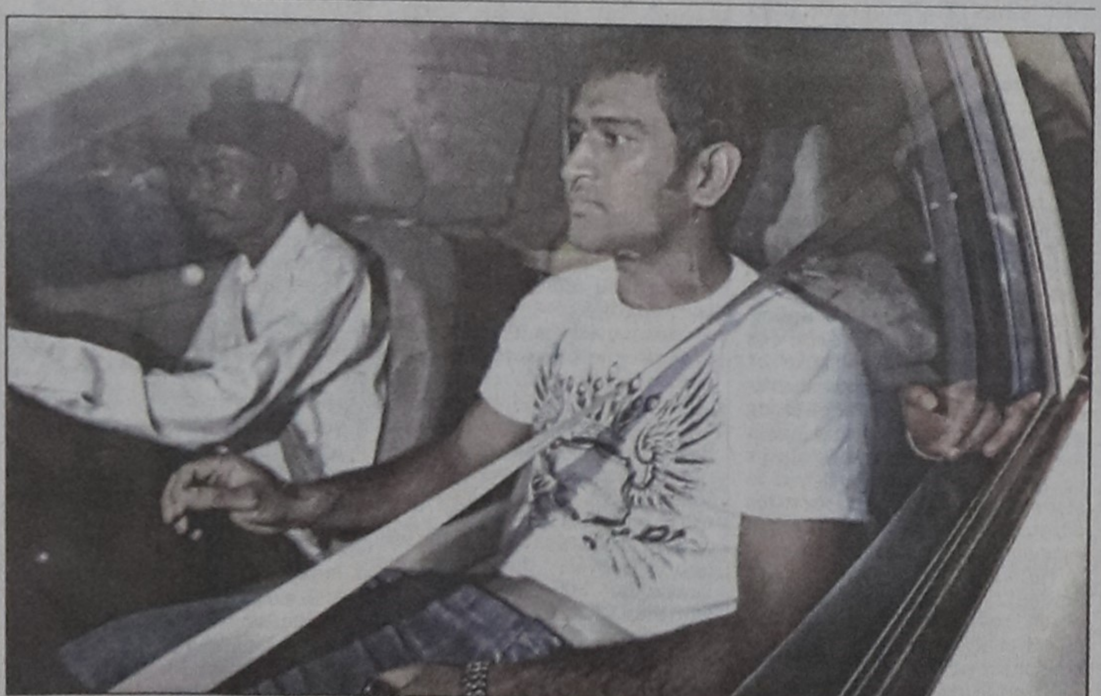
India one-day captain Mahendra Singh Dhoni (R) leaves after attending a team selection meeting for tri-series in Bangladesh and Asia Cup in Pakistan in Mumbai yesterday.