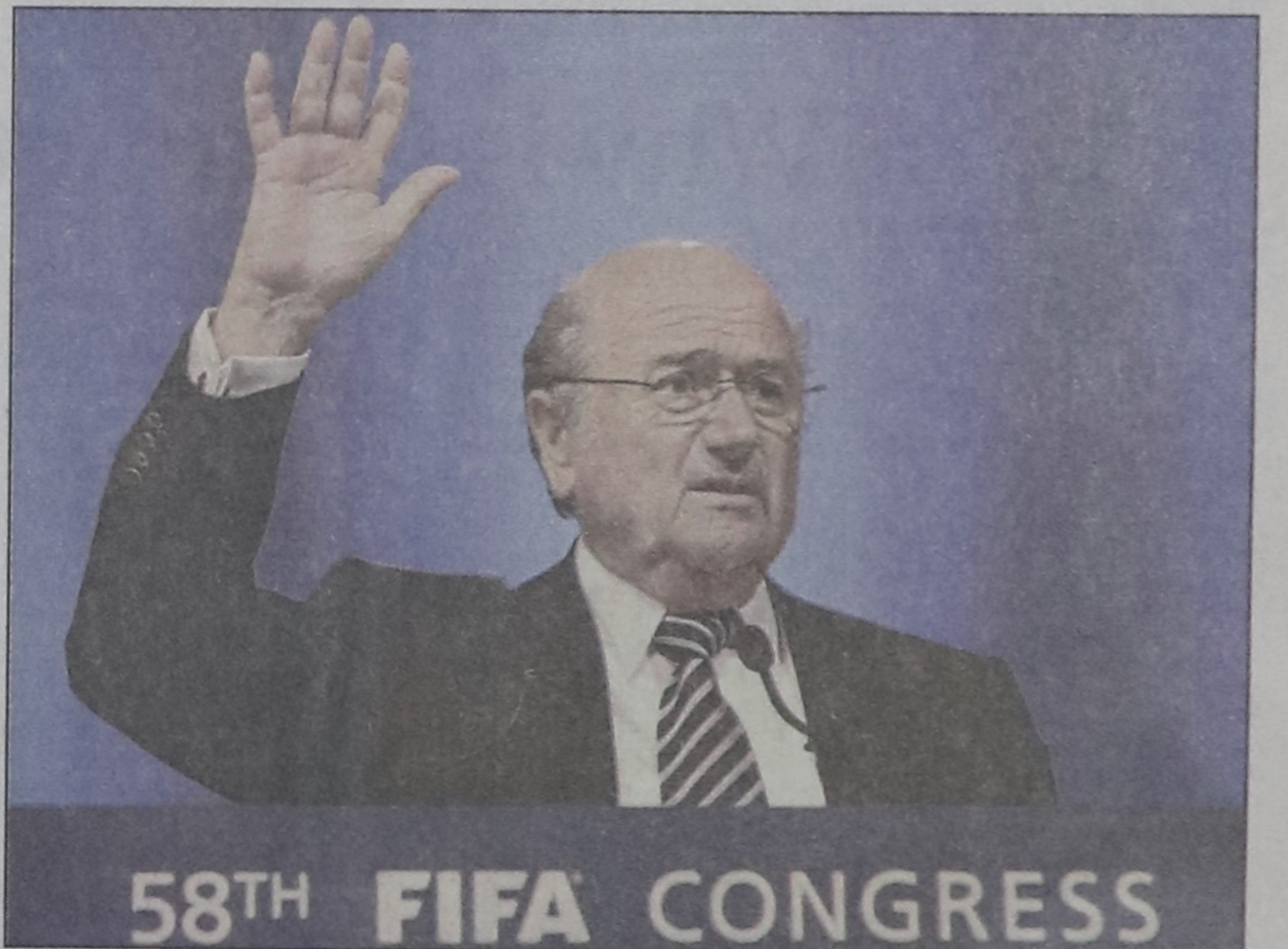
FIFA president Joseph Sepp Blatter gestures while addressing delegates at the 58th FIFA Congress in Sydney yesterday.