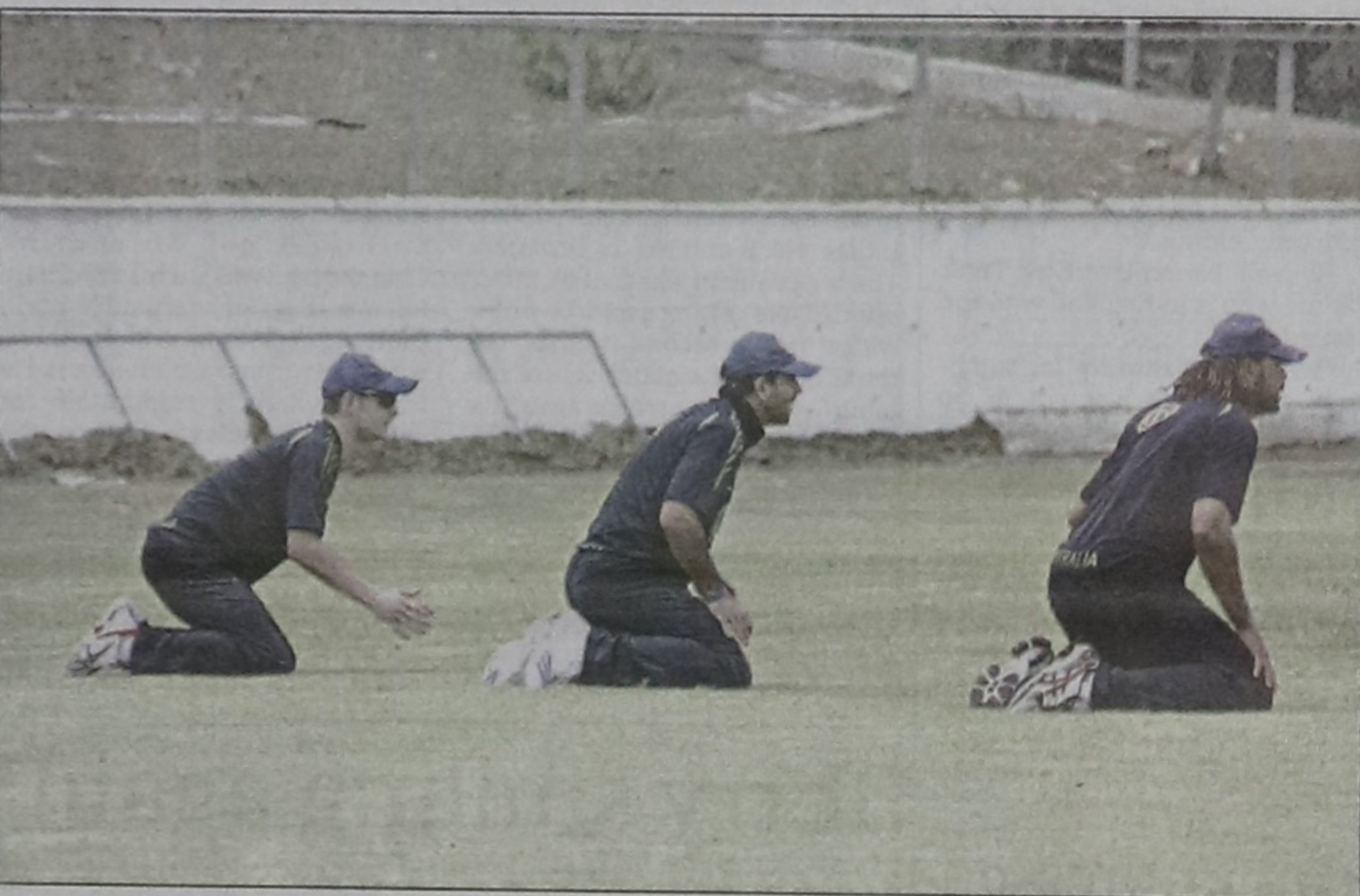
Australian captain Ricky Ponting (C), Andrew Symonds (R) and Michael Clarke go on their knees while taking slip catches at the Antigua Recreational Ground on Wednesday.

Kyrgyzstan in the AFC Challenge Cup qualifiers -- and two warm-up games against home-based sides. Yet to win a single international match since their Asian Cup qualifiers victory against Pakistan in December 2005, Bangladesh will take on lowly Bhutan in their SAFF opener in Colombo on June 4. Bangladesh, who fly to the Sri Lankan capital tonight, face Afghanistan on June 6 and co-hosts Sri Lanka two days later in their final group match. The SAFF Championship kicks off in Maldives capital Male on June 3 with India playing Nepal in the opener followed by the match between the hosts and Pakistan.