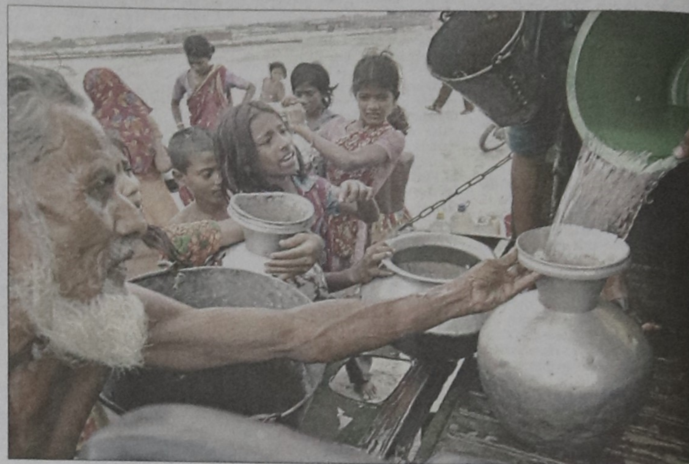
Army personnel distribute drinking water among slum dwellers at Hazaribagh in Dhaka yesterday as an acute water crisis persists in the area.