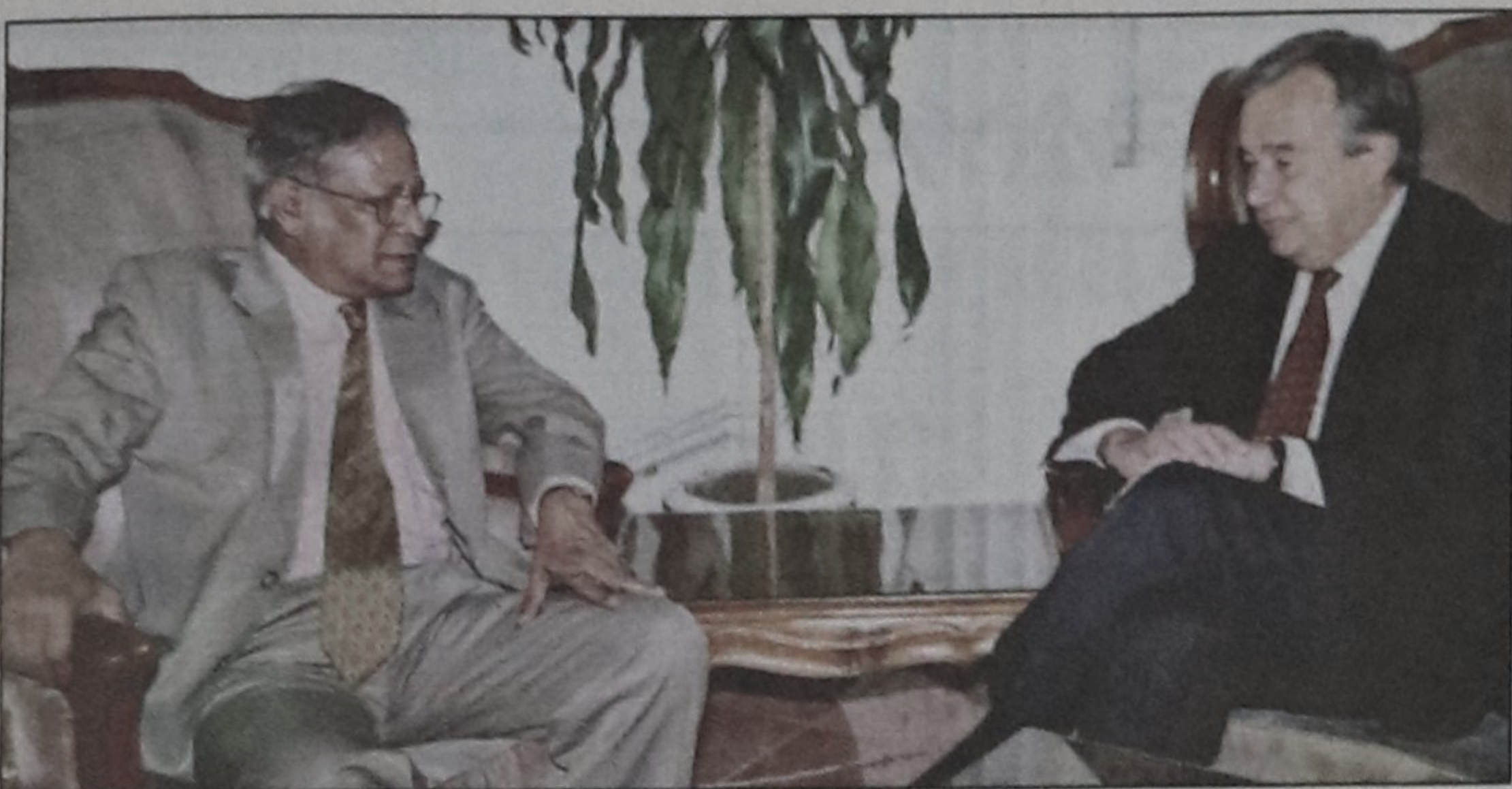
Visiting United Nations High Commissioner for Refugees Antonio Guterres calls on Food and Disaster Management Adviser AMM Shaukat Ali at the latter's office in the city yesterday.